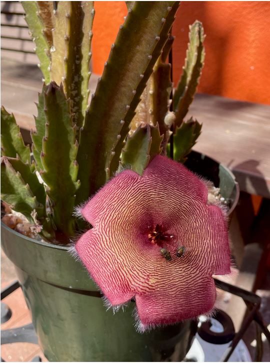
Stapelia gigantea by Debra Bushweit Galliani