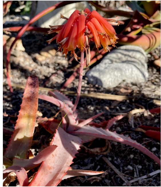
Aloe camperii