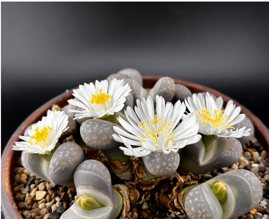
Lithops hookeri var. lutea