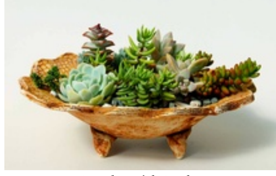
Succulent Dish Garden