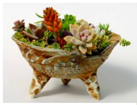
Succulent Dish Garden