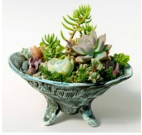
Succulent Dish Garden