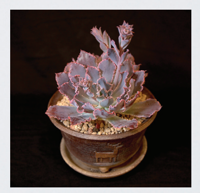
Echeveria 'Neon breakers'