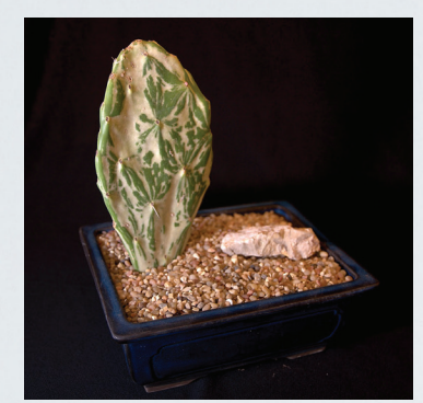
Opuntia vulgaris variegata