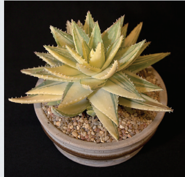
Aloe brevifolia variegata