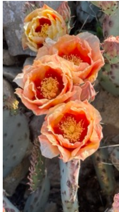
Opuntia macrocentra 'Sapphire'