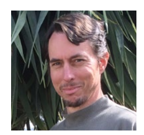
SOUTH COAST CACTUS & SUCCULENT SOCIETY