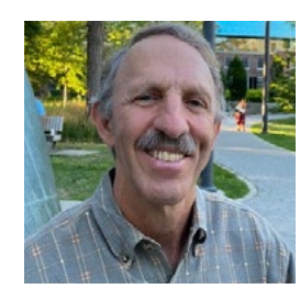
SOUTH COAST CACTUS & SUCCULENT SOCIETY

South Coast Botanic Garden, Frances Young Hall 26300 Crenshaw Blvd., Palos Verdes Peninsula, CA