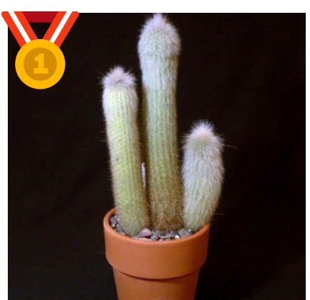
1st: Braulio Mena Cleistocactus strausii 'Silver Torch'