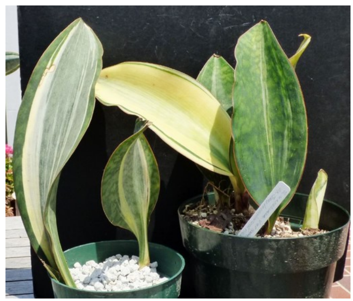
Variegated Sansevieria masoniana