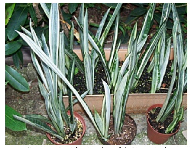
Sansevieria trifasciata 'Bantle's Sensation'

Gasteria – The Japanese have made an art of Gasteria and Haworthia variegate cultivation. Read the 2000 CSSA Journal for just a sampling of the wonderful cultivars. Miniature white species, yellow species, even the occasional pink can be found. There are dozens of variegated Gasterias shown at our shows, and available from all of the local vendors. Look for Gasteria 'Little Warty', a nice white and green species, as well as many of the yellow and green species such as the Japanese hybrid Gasteria 'shozodan'.