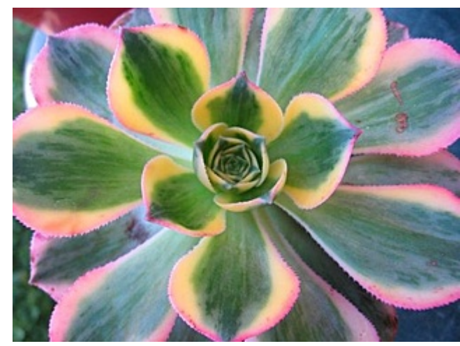
Aeonium 'Compton Carousel' Variegated

Variegation is known in most plant families, and variegated plants have a place in most gardens. The bright yellow and white of variegated foliage adds pattern and rhythm to many herbaceous borders. In succulent plants variegates are generally separated from normal plants, and compete against other variegates to put them on an equal footing. Variegated plants grow slower and are generally smaller than non-variegates of the same species. A large well grown variegate of any species is truly an achievement.