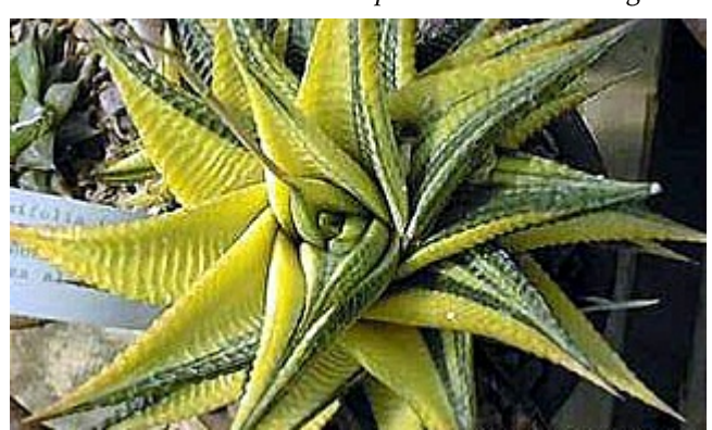
Haworthia limifolia variegated