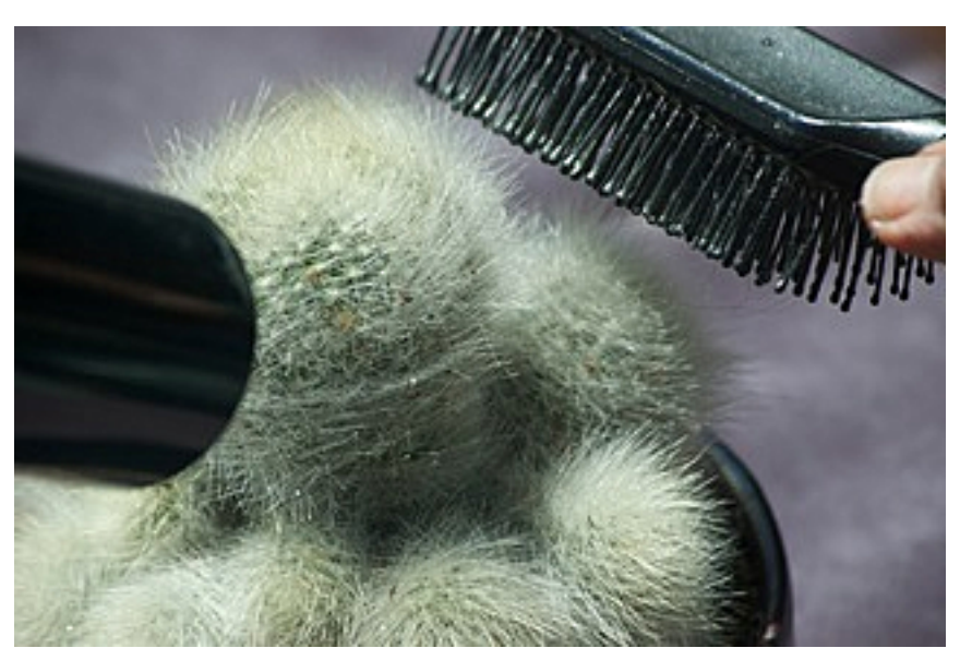
The above photo shows the meticulous attention to detail taken by the Caplan household when preparing a plant for a show :-).