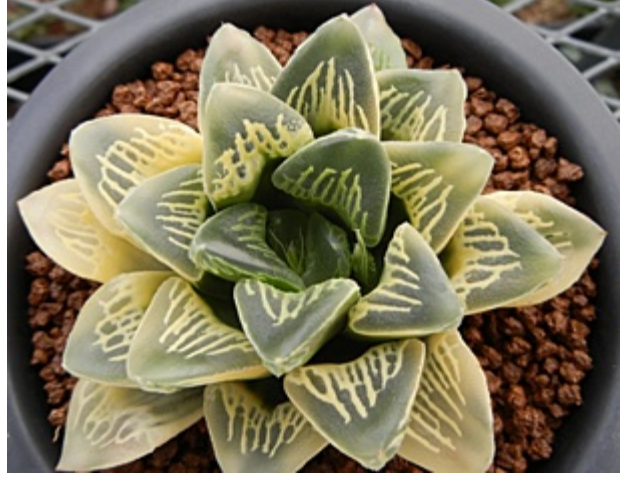
Haworthia comptonia variegated