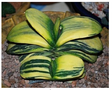
Gasteria nitida var armstrongi