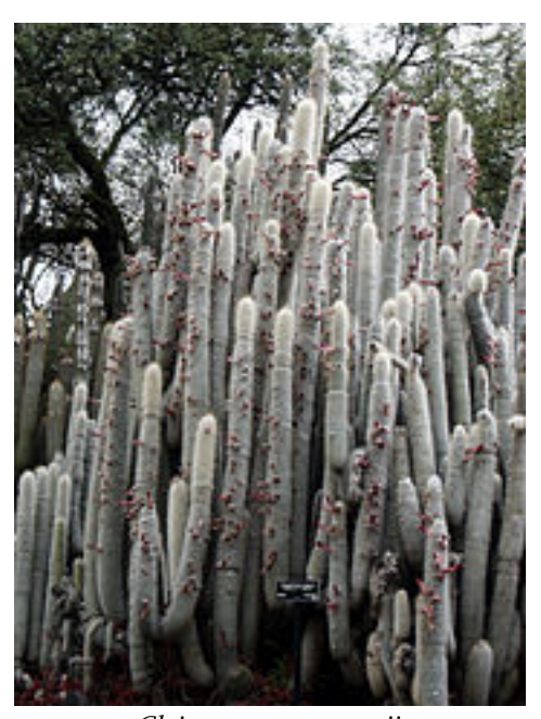
Cleistocactus strausii

Pilosocereus is a largely Brazilian genera. It has a wide distribution, stretching into central Mexico. Many of the species are a glaucous blue with bright yellow spines and hairy areoles. Pilosocereus magnificus is one of these, with 4 to 12 deep ribs. The outer edges are covered with short yellow spines. Pilosocereus aureispinus has very 18 to 20 shallow ribs, and distinct areoles, that make dense yellow spirals around the plant on a dark green background. Tom Glavich 02/04