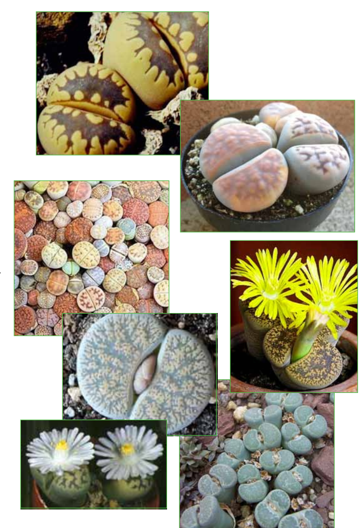
The Plant-of-the-Month articles and photos provided by Jim Tanner.

Some species have flowers large enough to obscure the leaves. They open in the afternoon and close in the evening. Propagation of Lithops is by seed or cuttings. Cuttings can only be used to produce new plants after a plant has naturally divided to form multiple heads, so most propagation is by seed. Lithops can readily be pollinated by hand if two separate clones of a species flower at the same time, and seed will be ripe about 9 months later. Seed is easy to germinate, but the seedlings are small and vulnerable for the first year or two, and will not flower until at least two or three years old.