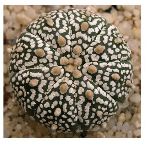
Astrophytum asterias 'Super Kabuto'