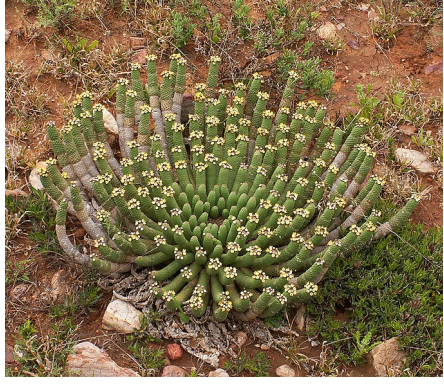
Euphorbia caput-medusa ("Medusa's Head")