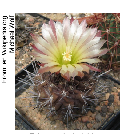
Eriosyce heinrichiana Subsp. Intermedia