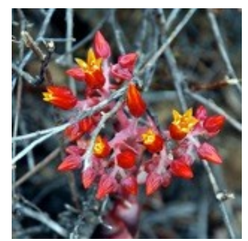
Dudleya along the California Central Coast