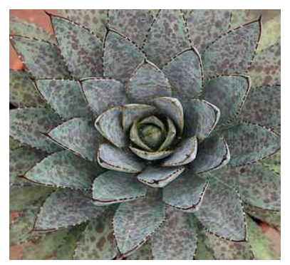
Agave mangave 'bloodspot' San Marcos Growers