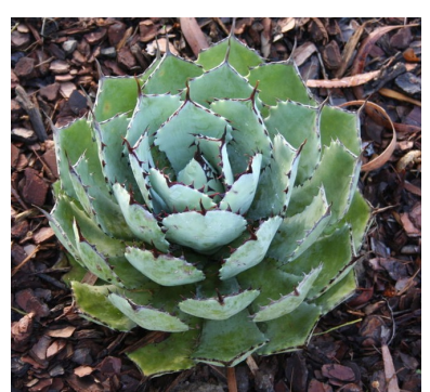
Agave potatorum 'Kichiokan' Wikipedia