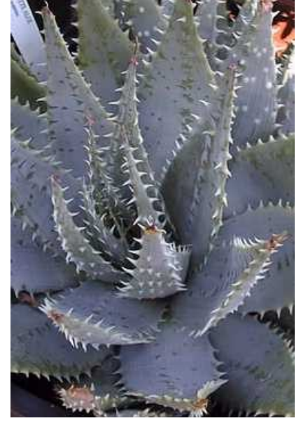
Aloe pratensis (Rosette Aloe)