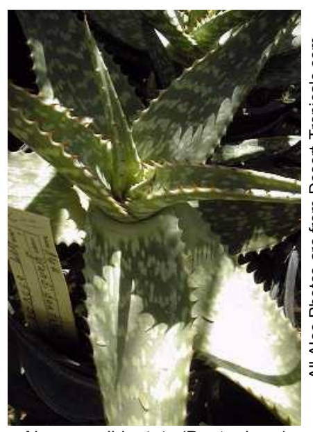
Aloe grandidentata (Bontaalwyn)