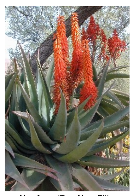
Aloe ferox (Tap Aloe, Bitter Aloe, Cape Aloe)