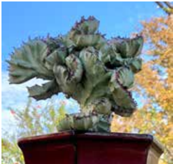
Euphorbia lactea monstrosa crest by Anita Caplan