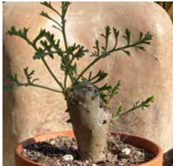
Pelargonium crithmifolium crest by Anita Caplan