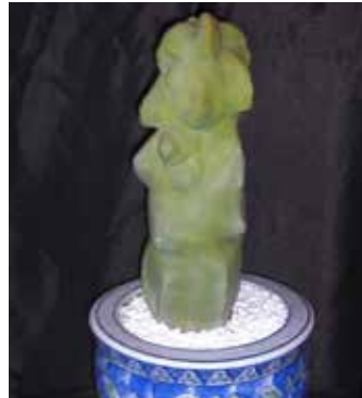
Lophocereus schottii by Phyllis DeCrescenzo