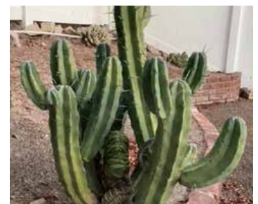
Myrtillocactus geometrizans cristata by Terri Straub