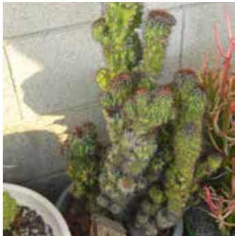
Cereus peruvianus by Phyllis DeCrescenzo