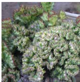
Euphorbia lactea crest by Phyllis DeCrescenzo