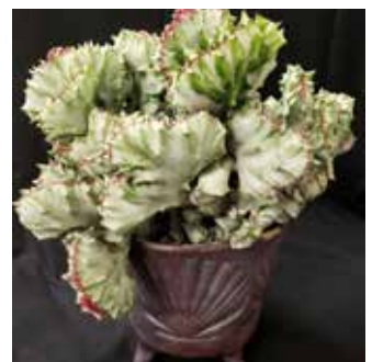
Euphorbia lactea crest by Sally Fasteau