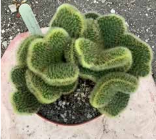
Cleistocactus aureispina cristata by Terri Straub