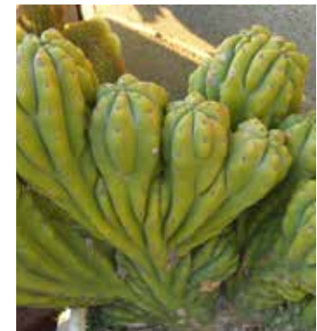
Trichocereus monstrose by Phyllis DeCrescenzo