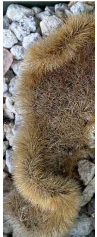
Crested cactus