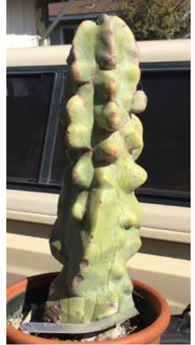
Lophocereus schottii monstrose