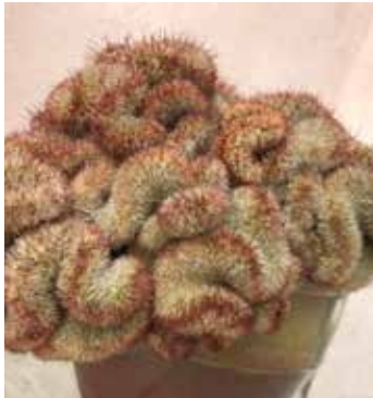
Crested Mammillaria