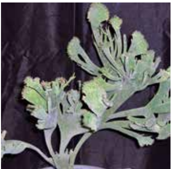
Euphorbia crest by Phyllis DeCrescenzo