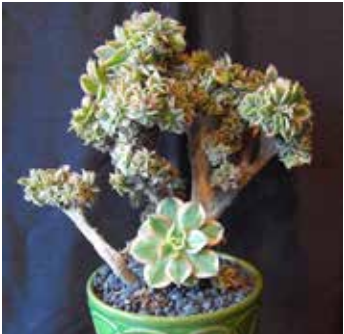
Aeonium 'Sunburst' crest by Phyllis DeCrescenzo