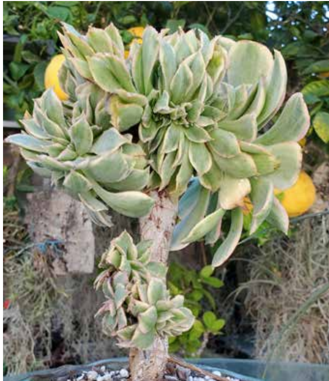
Aeonium 'Sunburst' crest by Laurel Woodley