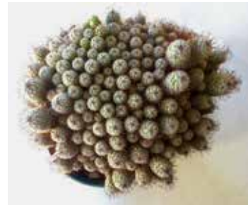
Mammillaria perezdelarosae