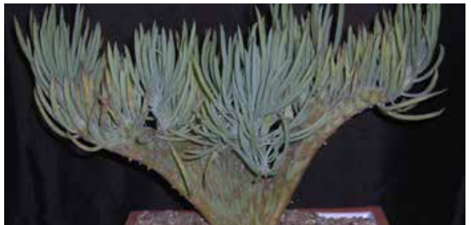
Senecio vitalis cristata by Phyllis DeCrescenzo