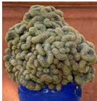
Mammillaria geminispina cristata