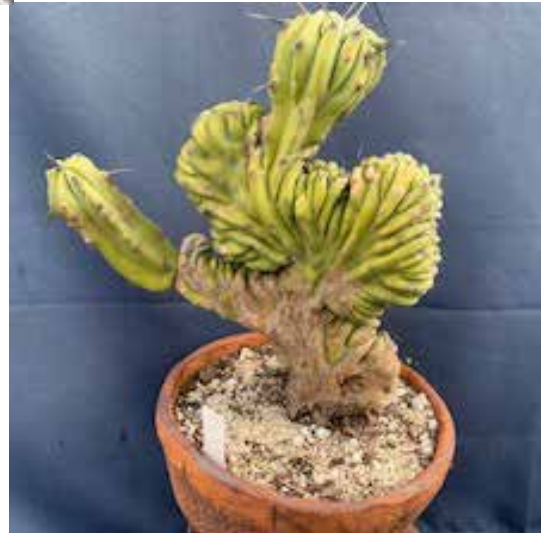
Euphorbia crested by Joe Tillotson