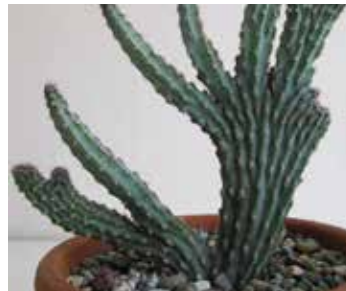
Monvillea spegazzinii cristata