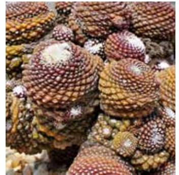
Copiapoa tenuissima 'Monstrose' by Laurel Woodley