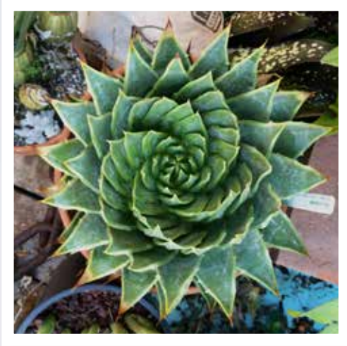
Aloe polyphylla