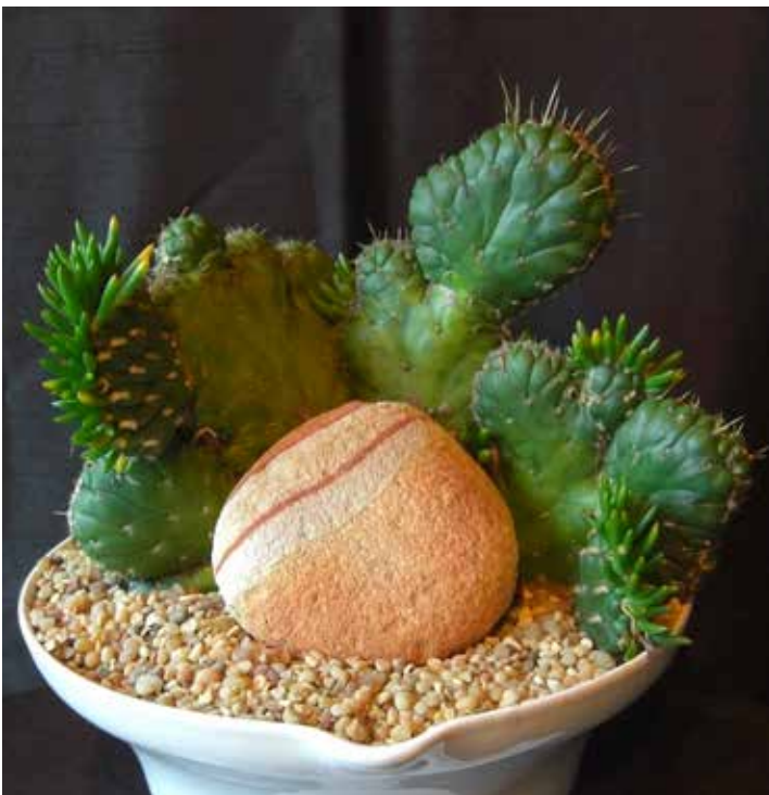
Euphorbia lactea crest by Phyllis DeCrescenzo