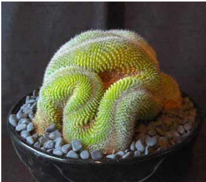
Mammillaria pilcayensis