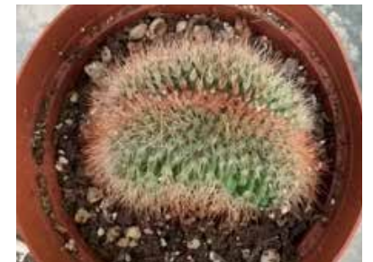
Mammillaria spinosissima cristata