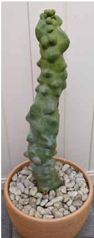
Lophocereus schottii monstrose by Lemono Lott