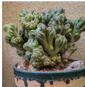
Cereus forbesii monstrose 'Ming Thing' by Lemono Lott