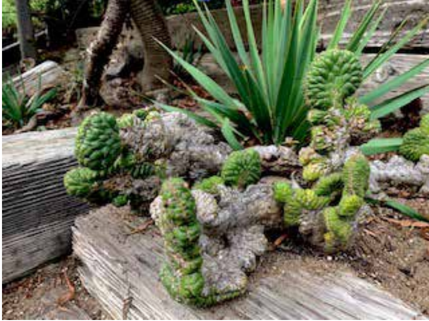
Euphorbia crested by Joe Tillotson