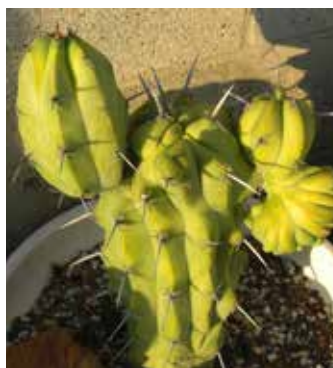
Myrtillocactus geometrizans by Phyllis DeCrescenzo