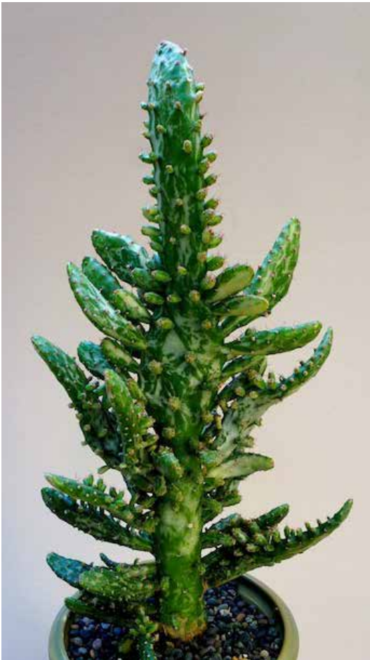
Opuntia monacantha