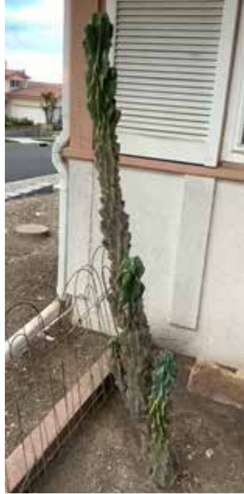
Cereus peruvianus monstrose by Terri Straub