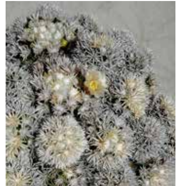
Mammillaria gracilis 'Arizona Snowcap'