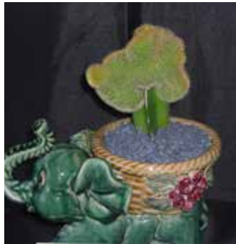
Cleistocactus winterti cristata by Phyllis DeCrescenzo