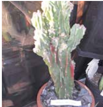
Cereus peruvianus monstrose by Phyllis DeCrescenzo