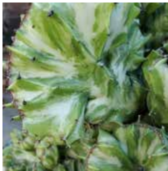
Euphorbia lactea crest by Laurel Woodley