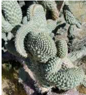
Cylindropuntia fulgida f. Monstruosa