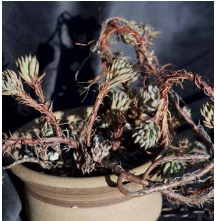
Sedum sp.