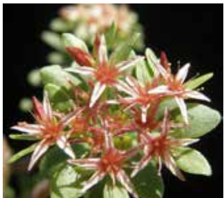
Sedum oxypetalum by Laurel Woodley