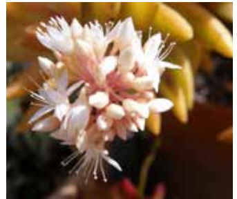
Sedum nusbaumerianum by Laurel Woodley