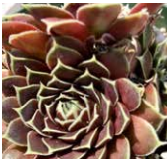
Sempervivum heuffellii 'Giuseppi Spiny' by Sonita Bantad