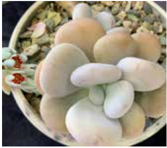
Pachyphytum sp. by Maria Capaldo

SUCCULENT CATEGORY: OPEN (Continued next page)