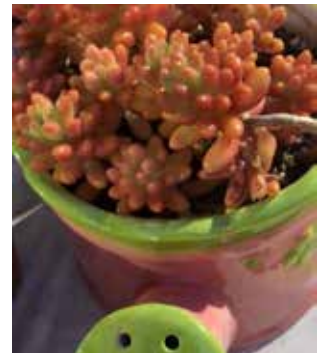
Sedum rubrotinctum by Sonita Bantad