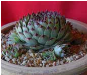
Sempverium calcareum by Phyllis DeCrescenzo