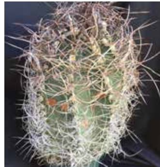
Astrophytum capricorne by Gary Duke