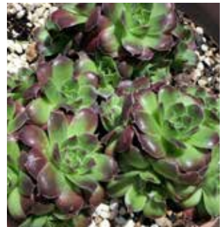
Sempervivum sp. by Sonita Bantad