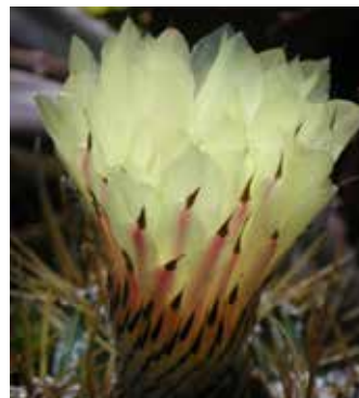
Astrophytum ornatum by Laurel Woodley