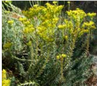
Sedum reflexum by Laurel Woodley