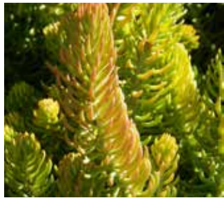
Sedum rupestre 'Angelina' by Laurel Woodley.