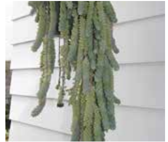
Sedum 'Burrito' by Laurel Woodley