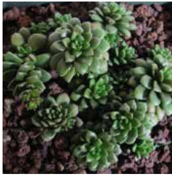
Cremnosedum 'Little Gem'