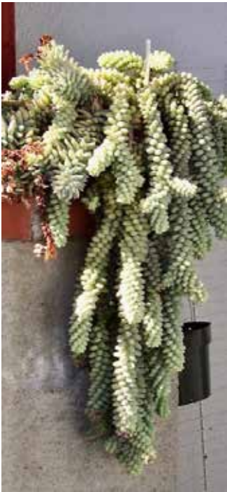
Sedum morganiium by Dale LaForest