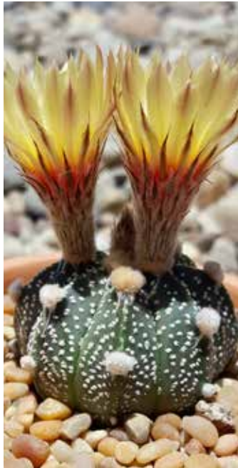
Astrophytum sp. by Nancy Sams