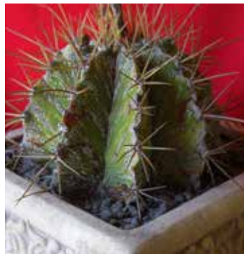
Astrophytum ornatum by Phyllis DeCrescenzo