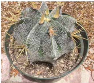
Astrophytum ornatum by Terri Straub