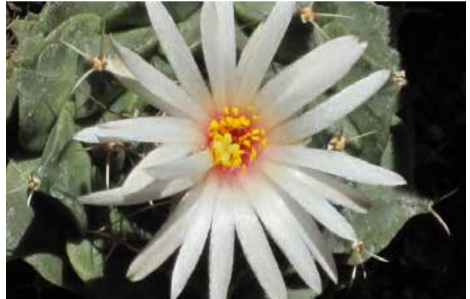
Obregonia denegrii in flower