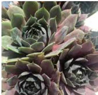
Sempervivum 'Red Heart' by Sonita Bantad