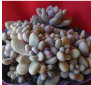
Pachyphytum oviferum by Phyllis DeCrescenzo