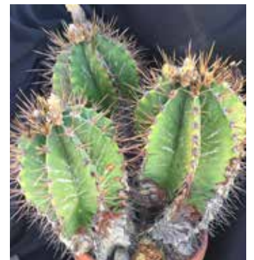
Astrophytum ornatum by Gary Duke