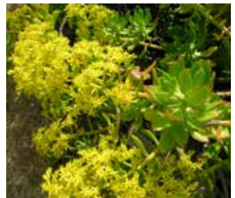
Sedum prealtum by Laurel Woodley