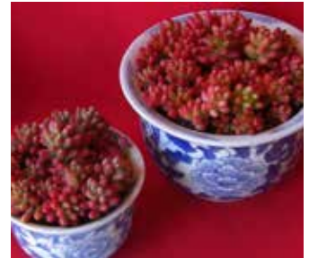
Sedum rubrotinctum by Phyllis DeCrescenzo