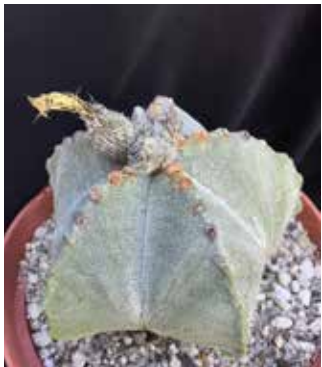
Astrophytum myriostigma by Gary Duke