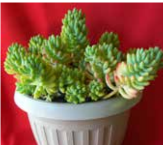
Sedum pachyphyllum by Phyllis DeCrescenzo