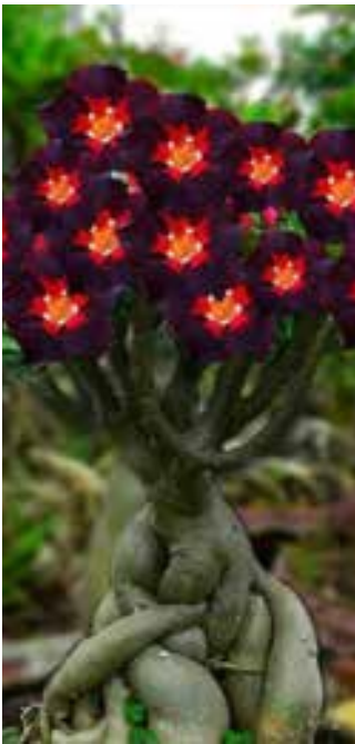
Adenium obesum 'Black'