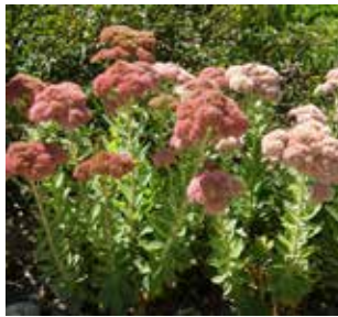
Sedum spectabile by Laurel Woodley