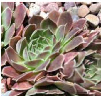
Sempervivum 'Pink Sky' by Sonita Bantad