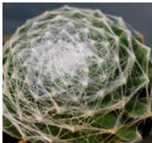
Sempverium arachnoideum by Laurel Woodley