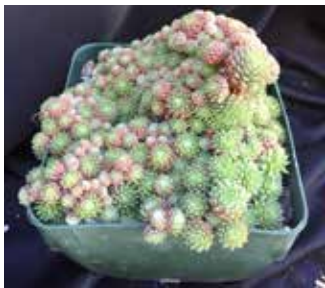
Sempverium arachnoideum v minor by Gary Duke