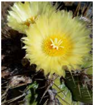
Astrophytum ornatum by Laurel Woodley