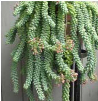
Sedum morganianum