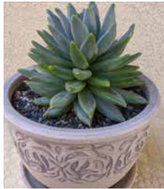
Pachyphytum compactum by Lemono Lott