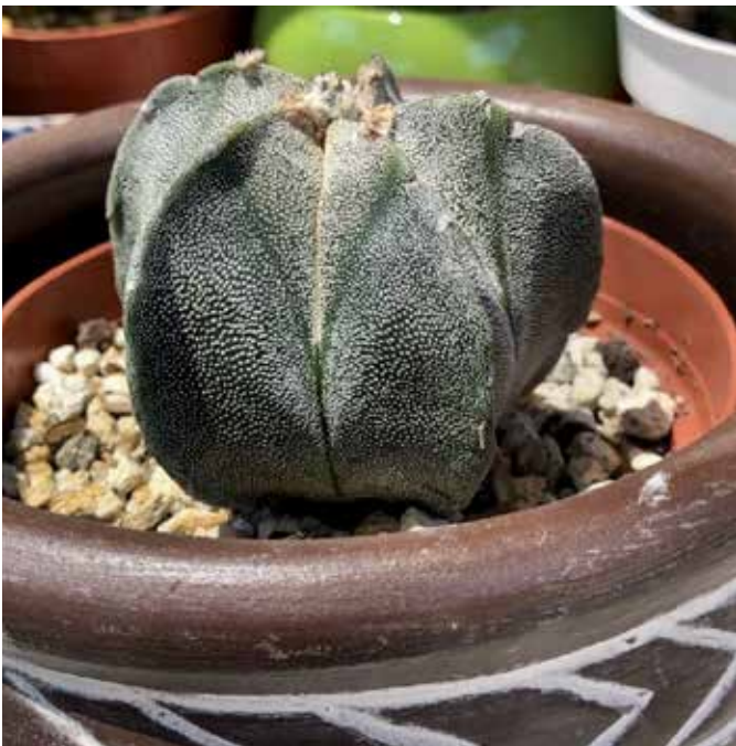
Astrophytum myriostigma by Sonita Bantad