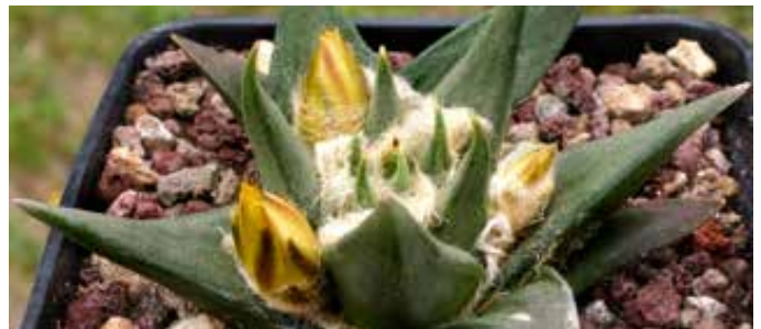
Ariocarpus retusus var. trigonus