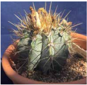
Astrophytum ornatum by Joe Tillotson