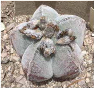
Astrophytum myriostigma by Terri Straub