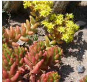
Sedum rubrotinctum by Laurel Woodley