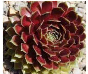
Sempverium 'Ohioan' by Laurel Woodley