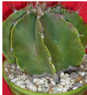
Astrophytum ornatum by Phyllis DeCrescenzo