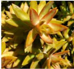
Sedum nusbaumerianum by Laurel Woodley