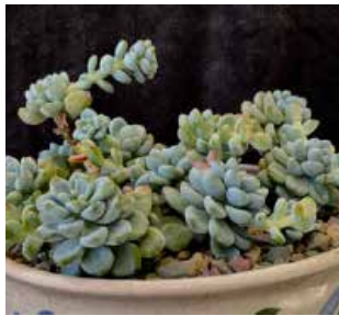
Sedum clavatum