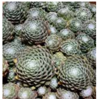
Sempervivum sp. by Sonita Bantad