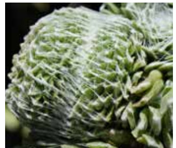
Sempverium arachnoideum 'Crest' by Laurel Woodley