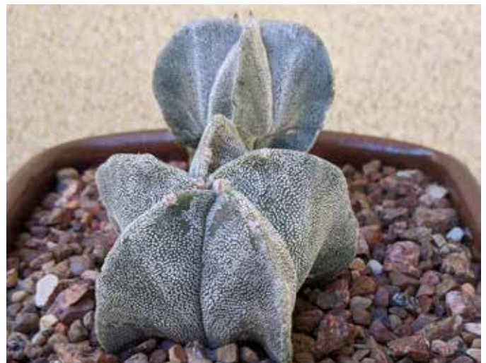
Astrophytum myriostigma by Lemono Lott