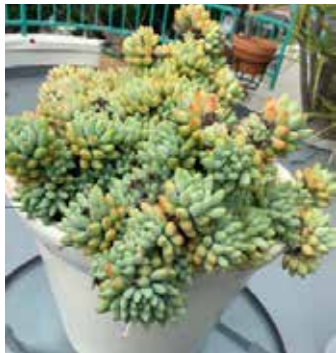
Sedum platyphylla by Joe Tillotson