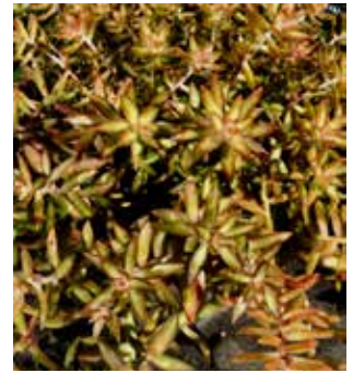
Sedum adolphii 'Fireworks' by Sonita Bantad