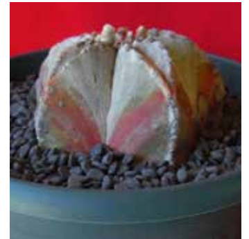
Astrophytum coahuilense by Phyllis DeCrescenzo