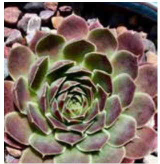
Sempervivum heuffellii 'Tan' by Sonita Bantad