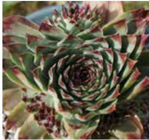
Sempverium calcareum by Laurel Woodley