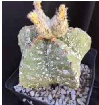
Astrophytum myriostigma Hybrid by Gary Duke