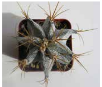
Astrophytum ornatum v. mirbellii