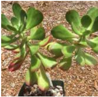
Sedum dendroideum 'Colossus' by Terri Straub