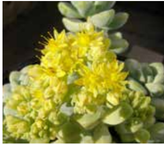
Sedum treleasei by Laurel Woodley