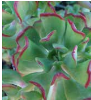
Sedum praealtum