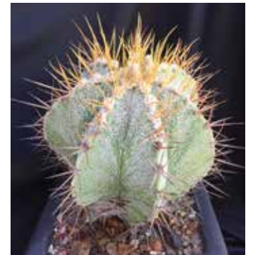
Astrophytum ornatum 'Meztitlan' by Gary Duke