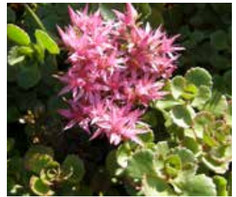
Sedum spurium by Laurel Woodley