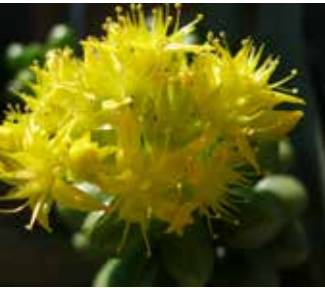
Sedum hernandezii