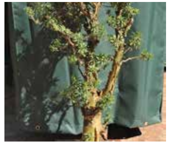
Sedum frutescens