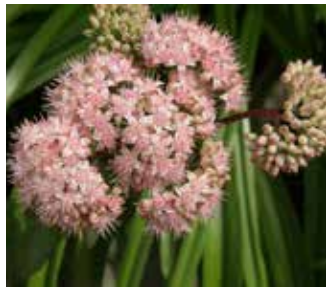
Sedum 'Matrona' by Laurel Woodley