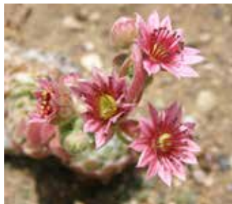
Sempverium arachnoideum by Laurel Woodley