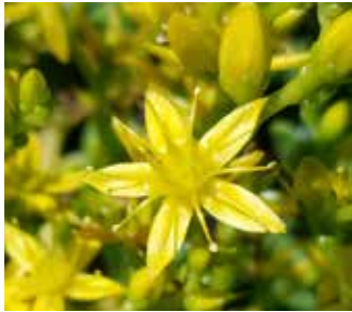
Sedum prealtum by Laurel Woodley