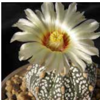
Astrophytum 'Super Kabuto' XA capricorne by Laurel Woodley