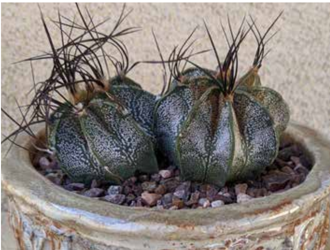
Astrophytum capricorne by Lemono Lott