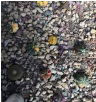
Astrophytum asterias by Gary Duke