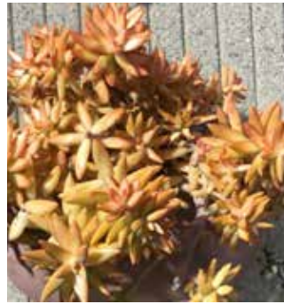
Sedum adolphii 'Fireworks' by Sonita Bantad