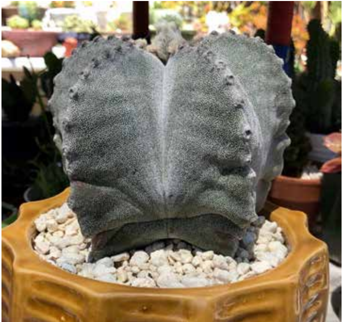
Astrophytum myriostigma by Sonita Bantad