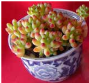
Sedum platyphyla by Phyllis DeCrescenzo