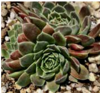
Sempervivum heuffellii 'Beacon Hill' by Sonita Bantad