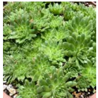
Sempervivum sp. by Sonita Bantad