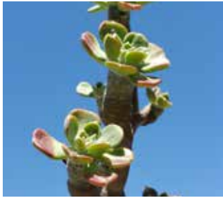
Sedum torulosum by Laurel Woodley