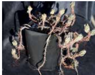
Sedum sp.