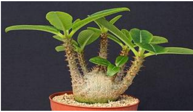
Pachypodium baronii var. windsorii