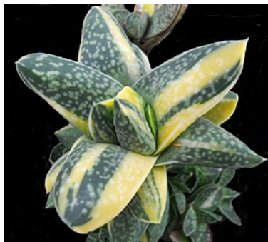
Gasteria gracilis f. variegata