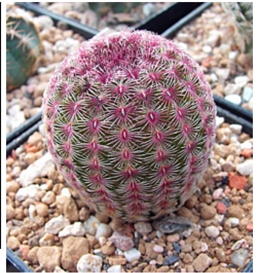
Echinocereus rigidissimus ssp. rubispinus