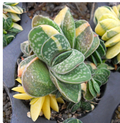
Gasteria pillansii f. variegata