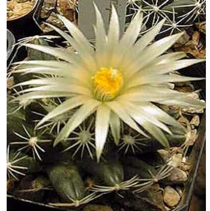
Pelecypora missouriensis subsp. asperispina