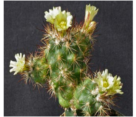
Acharagma roseanum subsp. galeanense

Cochemiea is a genus of cactus. It had previously been synonymized with Mammillaria , but molecular phylogenetic studies have shown they are different, and Cochemiea has been accepted as a separate genus. The genus Cochemiea has been expanded to include a large number of species previously placed in Mammillaria . There are currently 37 species in the genus Cochemiea .