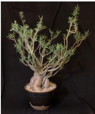
1st Jim Gardner Pachypodium bispinosum x succulentum