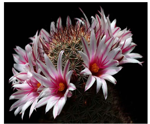
Cochemiea fraileana flower