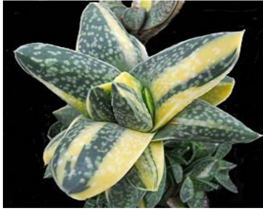
Gasteria gracilis , variegated

LATIN LOOK UP Loquerisne Latine (Do you speak Latin) The meanings of Latin plant names on pages 3-7