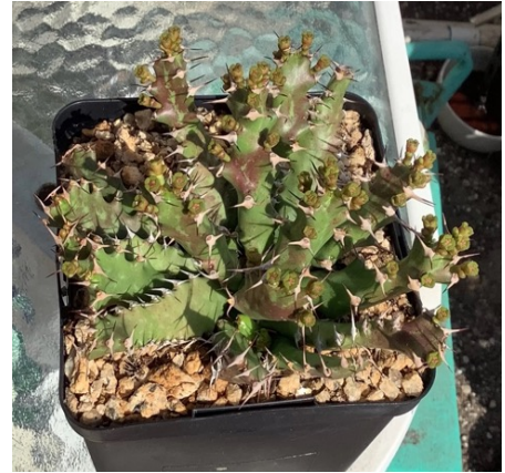
2nd Terri Straub Euphorbia stellata subsp. stellata