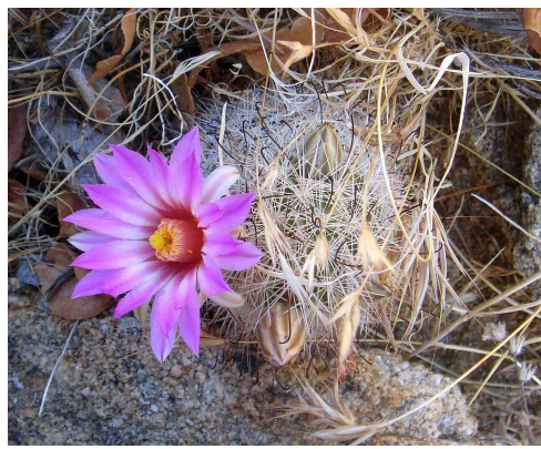
Cochemiea tetrancistra