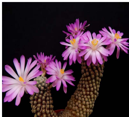
Cochemiea theresae

All species of Cochemiea feature short cylindrical stems that form small clumps of a dozen or more stems that prefer to grow in the cracks of rocks in habitat. The stems are tuberculate and heavily armed with stout spines, many featuring prominent hooked central spines. The flowers can be many different colors. In common with Mammillaria , the flowers are borne from the axils of the tubercles on second-year growth.