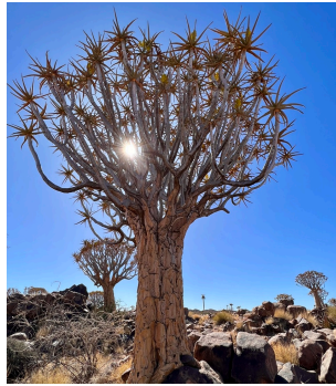
SOUTH COAST CACTUS AND SUCCULENT SOCIETY MEETING

Annual Show and Sale April 13-14th, 2024 9:00am - 4:00pm Palos Verdes Art Center 5504 Crestridge Road Rancho Palos Verdes, CA 90275