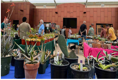
SOUTH COAST CACTUS AND SUCCULENT SOCIETY

Annual Show and Sale April 13-14th, 2024 9:00am - 4:00pm Palos Verdes Art Center 5504 Crestridge Road Rancho Palos Verdes, CA 90275