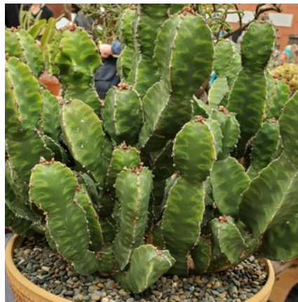
Euphorbia pseudocactus X by Jim Gardner