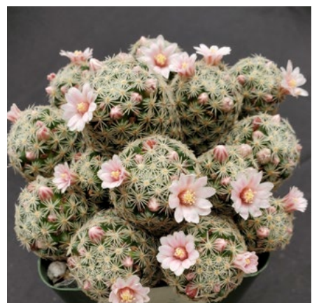
Mammillaria giselei