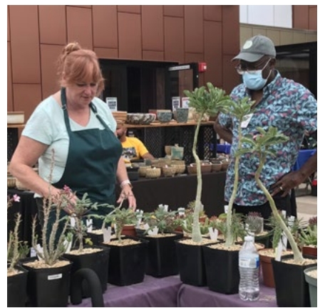
Inacia for PW Plants