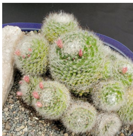
Mammillaria