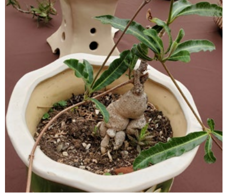
Raphionacme flanaganii