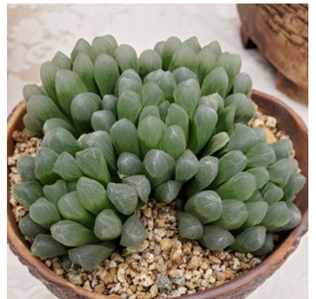
Haworthia cooperi var. truncata