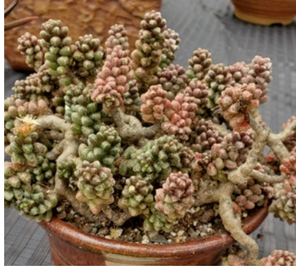
Sedum furfuraceum