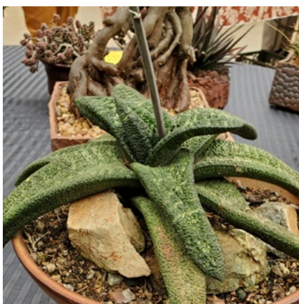
Gasteria batesiana