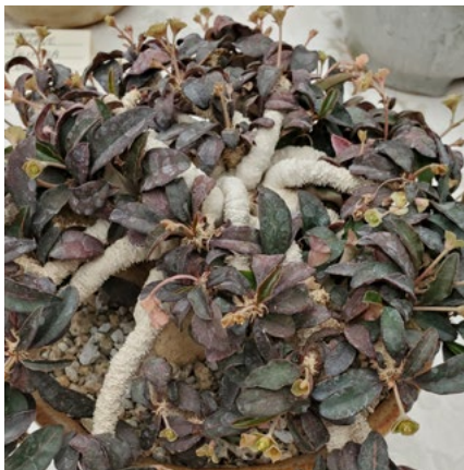
Euphorbia francoisii