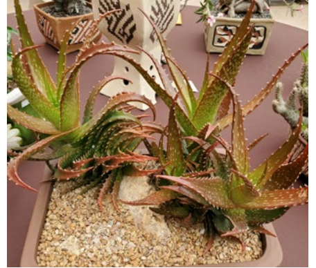
Aloe dorotheae by Lemono Lott