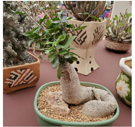
Fockea edulis by Lemono Lott