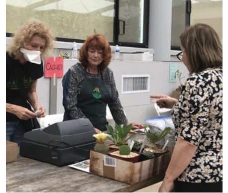
Even more cashiers