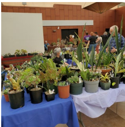
Society sales table