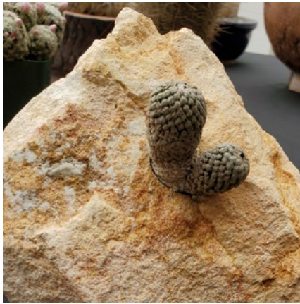
Turbincarpus veldeziianus by Gary Duke