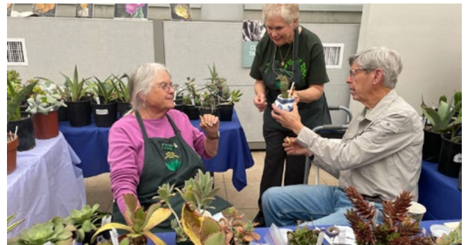
Photos from the 2022 South Coast Cactus & Succulent Show and Sale