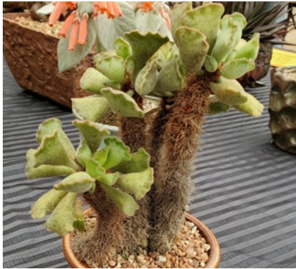
Adromischus cristatus by Laurel Woodley

GREEN THUMBS UP TO ALL THE SCCSS EXPERTS