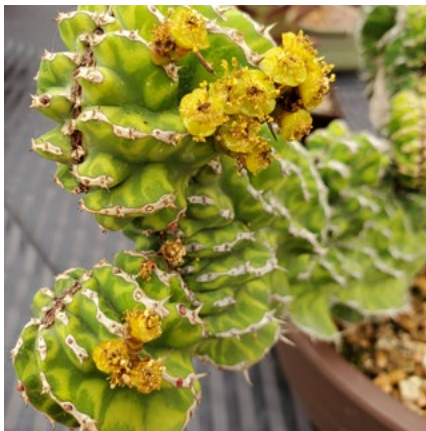
Euphorbia bussei var. kibwezensis flowers by Jim Gardner