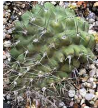
Copiapoa humilis