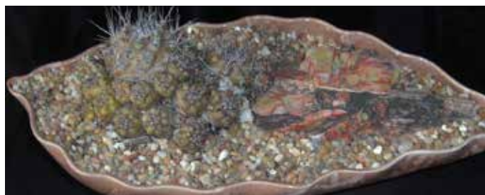
Copiapoa humilis by Phyllis DeCrescenzo