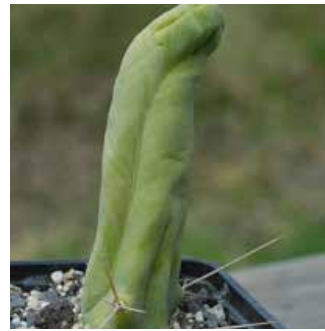
Tricocereus bridgesii forma. monstrosus