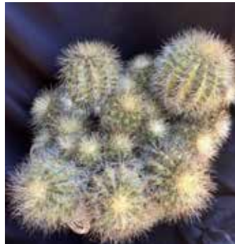
Copiapoa krainziana