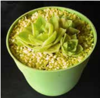
Graptopetalum macdougallii by Phyllis DeCrescenzo