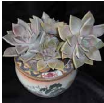
Graptopetalum paraguayense by Phyllis DeCrescenzo