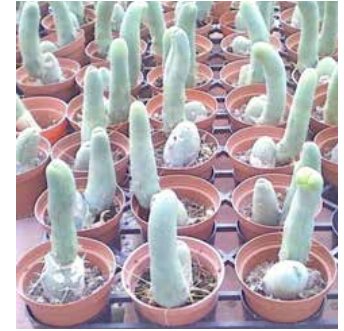
Tricocereus bridgesii forma. monstrosus