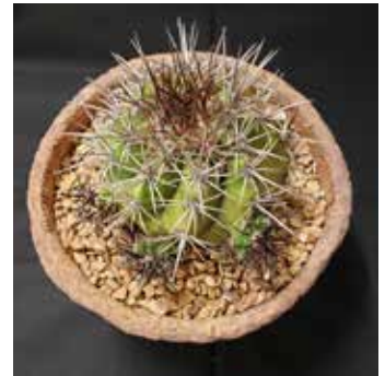
Copiapoa dealbata by Sally Fasteau