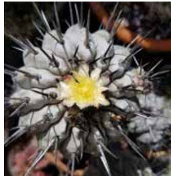
Copiapoa dealbata by Laurel Woodley