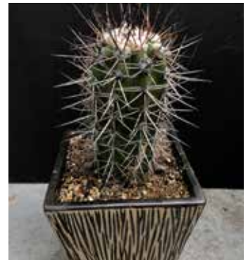
Copiapoa marginata