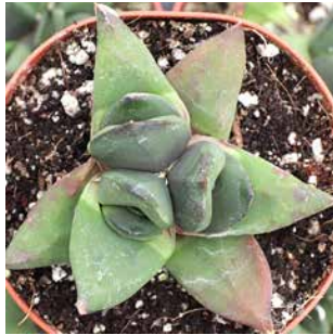
Gasteria nigricans f. monstrosa