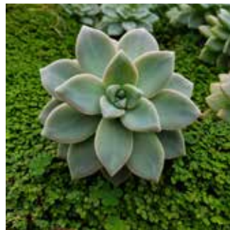
Graptopetalum paraguayense by Sally Fasteau