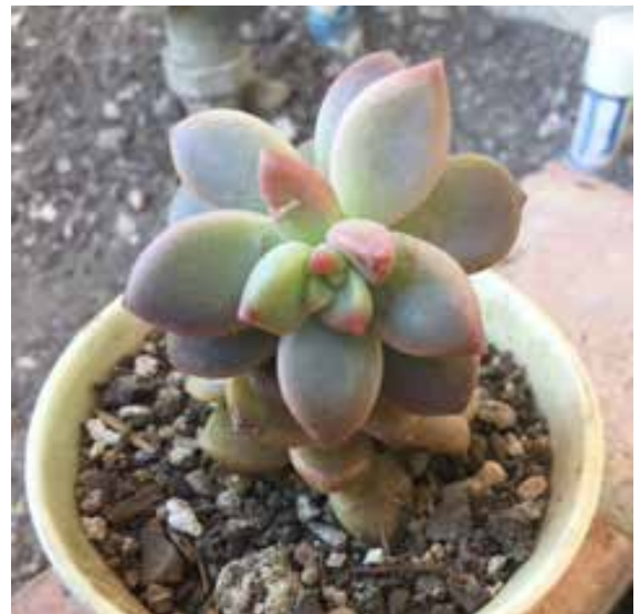
Graptopetalum by Terri Staub