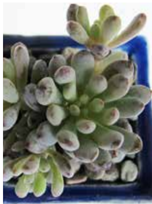
Graptopetalum pachyphyllum