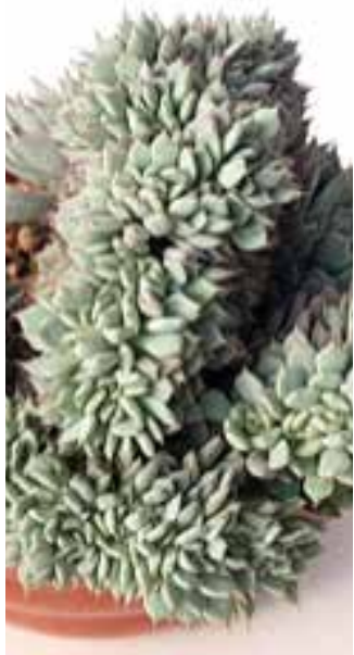
Echevaria cuspidata var. zaragozae f. cristata