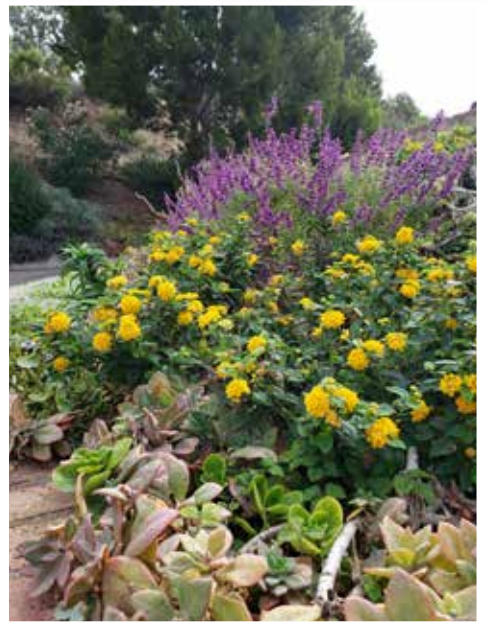
Sally Fasteau's garden