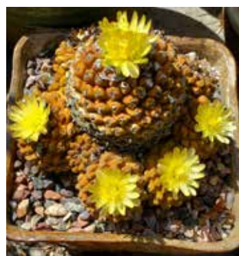
Copiapoa hypogaea by Laurel Woodley