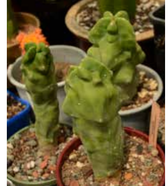
Lophocereus schottii forma. monstrosus