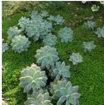
Graptopetalum paraguayense by Sally Fasteau