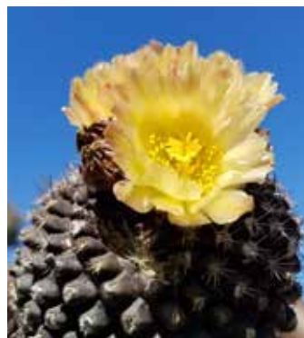
Copiapoa tenuissima by Laurel Woodley