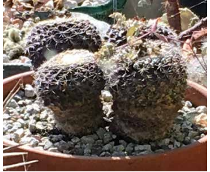
Cylindropuntia tenuissima