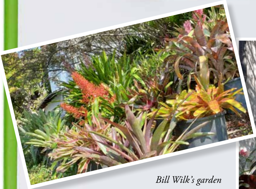
Bill Wilk's garden