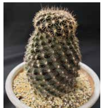
Copiapoa tenuissima by Sally fasteau