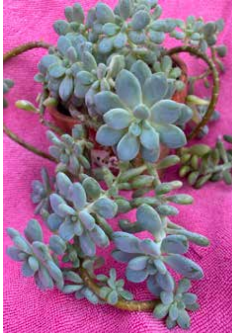
Graptopetalum by Anita Caplan