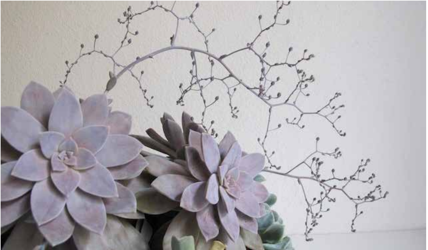
Graptopetalum pentandrum