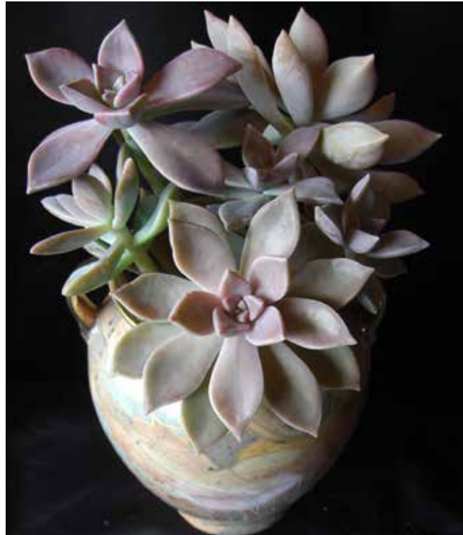
Graptopetalum paraguayense by Phyllis DeCrescenzo