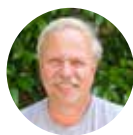
By Tom Glavich

Plants can exhibit mutated and regular growth at the same time. Crests and monstrose growth are unpredictable; no two are precisely alike. That goes for plants of the same species.