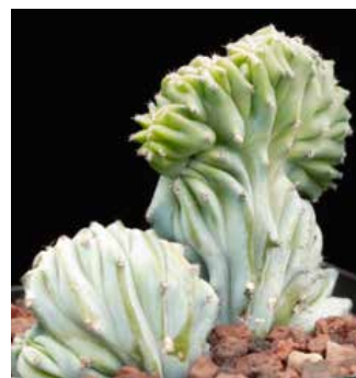
Myrtillocactus geometrizans 'Elite'