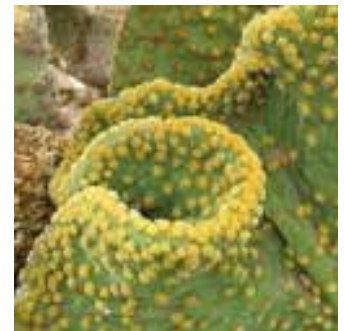
Opuntia microdasys pallida