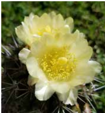
Copiapoa esmeraldana by Laurel Woodley