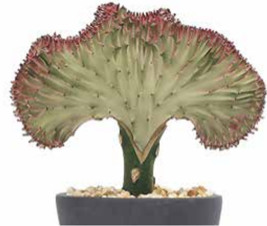
Euphorbia lactea f. cristata