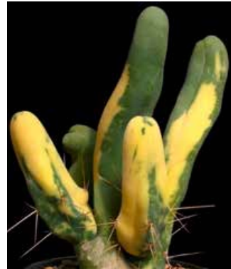
Tricocereus bridgesii forma. monstrosus