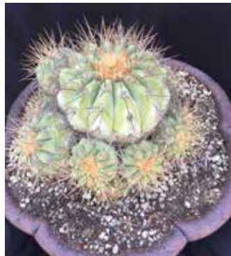
Copiapoa hazeltoniana