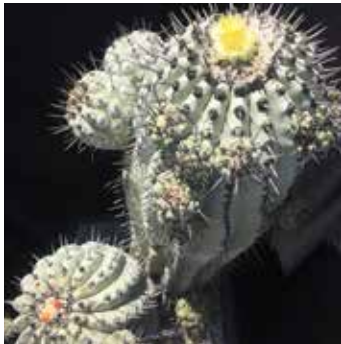
Copiapoa cinerea by Gary Duke