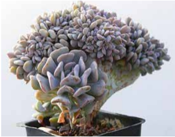
Echevaria 'Cubic frost' f. cristata