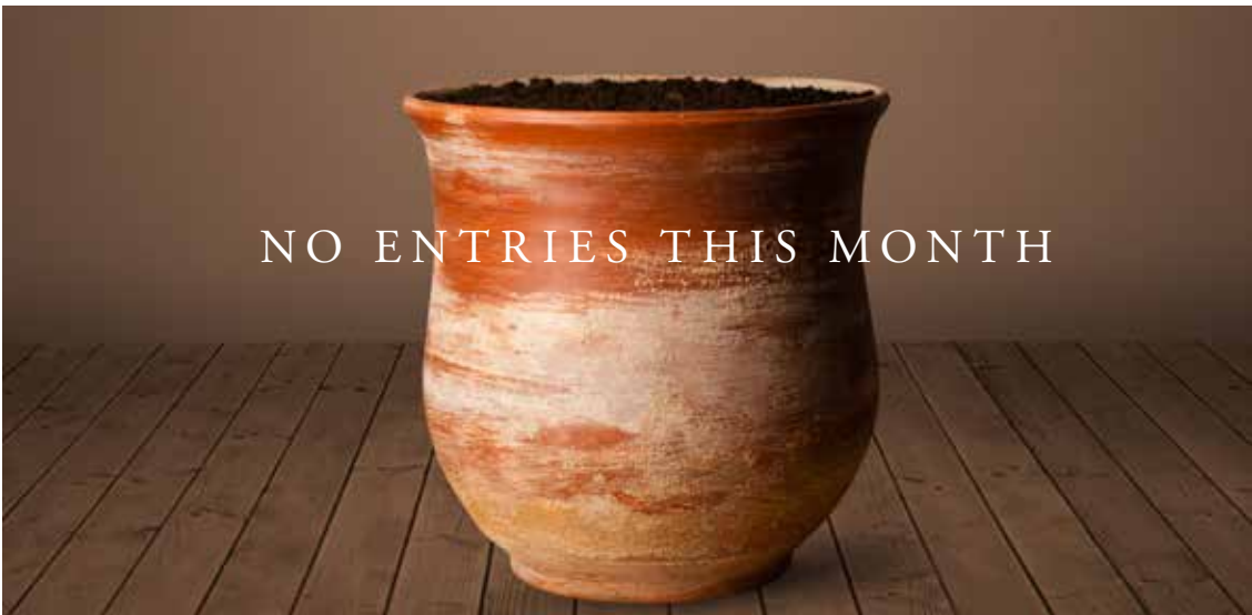
nihil hic hoc septimana sp. by anonymous