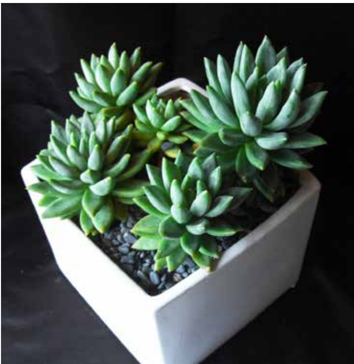
Pachyveria glauca 'Little Jewel' by Phyllis DeCrescenzo