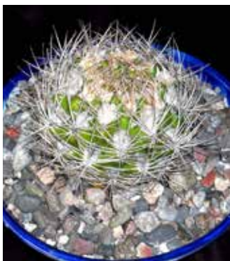
Copiapoa coquinbana v. pendulina by Phyllis DeCrescenzo