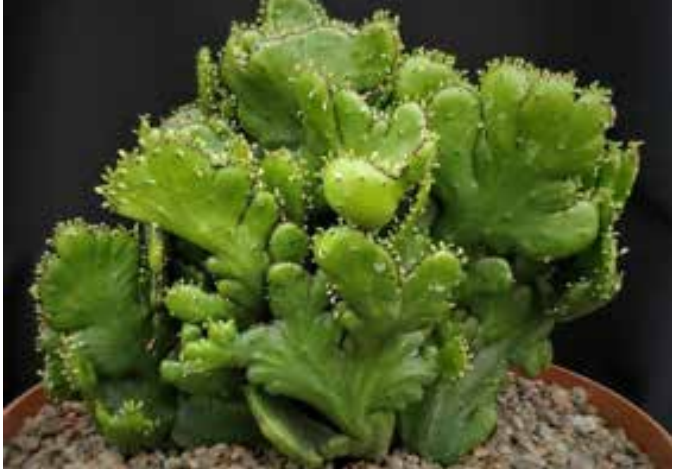
Euphorbia leucadendron f. cristata