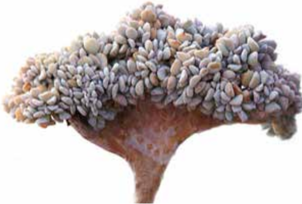
Echevaria 'Cubic frost' f. cristata