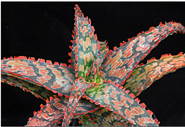
Aloe 'Jeff Karsner'