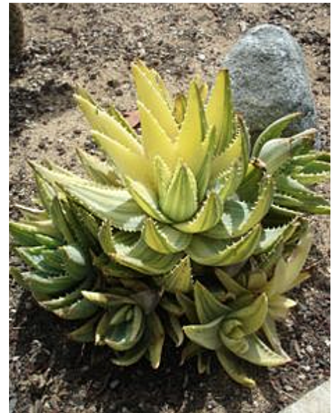
Aloe brevifolia variegata

Click to see the same with more photos on our website