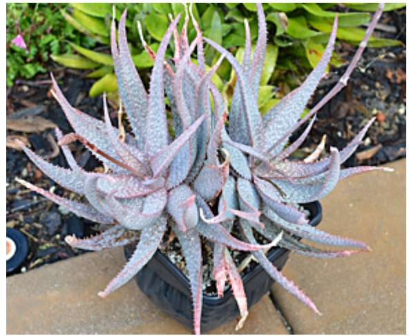
Aloe pictifolia hybrid