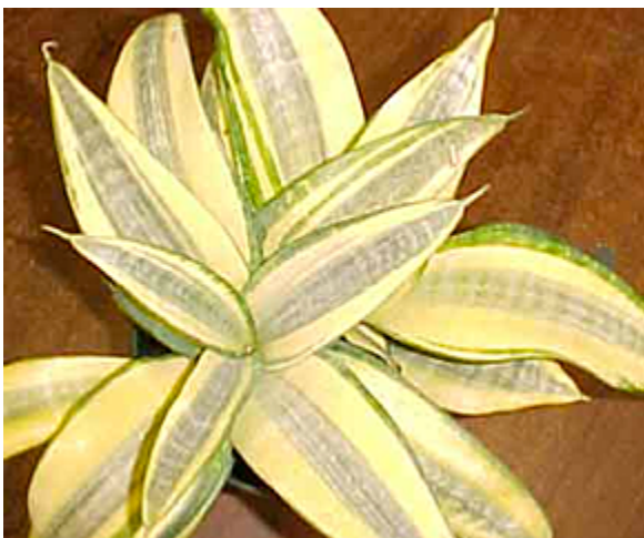
Sansevieria Golden Banner

Click to see the same with more pictures on our website