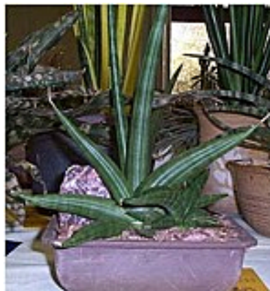
Sansevieria patens