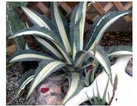
Agave americana mediopicta