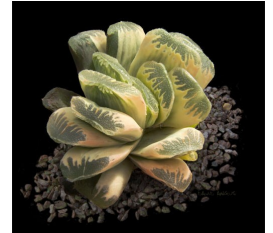
Haworthia truncata X maughanii