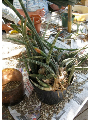
Sansevieria fischeri ready to be re-potted