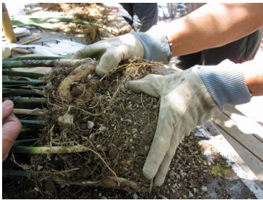
Rootbound Sansevieria ready for splitting