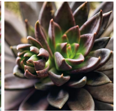
Black Knight Echeveria hybrid

University of California Irvine Arboretum Presents Prelude to Spring Winter Bulb Festival featuring African Bulbs Saturday, March 3, 10:00 am – 4:00 pm. Sunday, March 4, 11 am – 4:00 pm