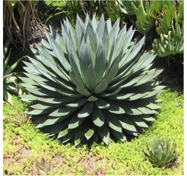
Agave 'Blue Flame'