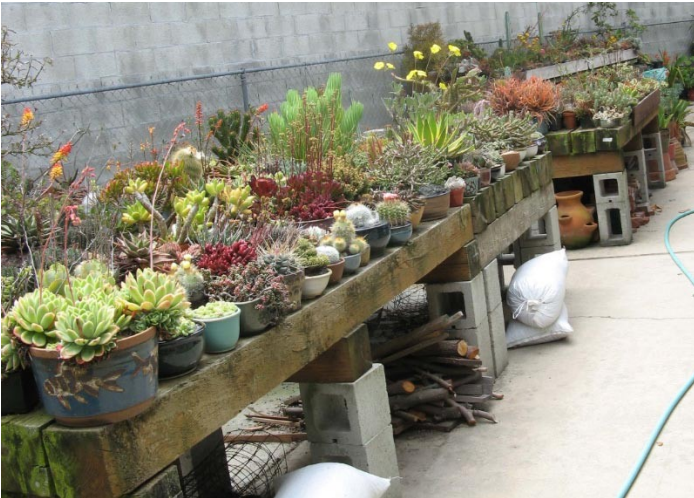
Jim's growing area even has great pots!