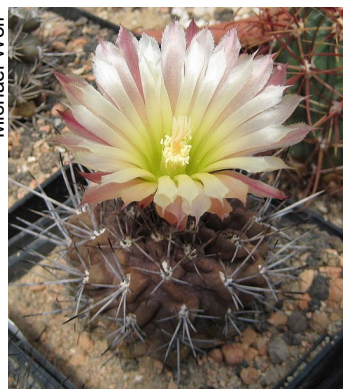
Eriocyce heinrichiana Subsp. intermedia