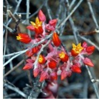
Dudleya along the California Central Coast

In horticulture, Dudleya should be planted at an angle. This allows accumulated water to drain from the nestlike center of the plant, thus preventing microbial decay.