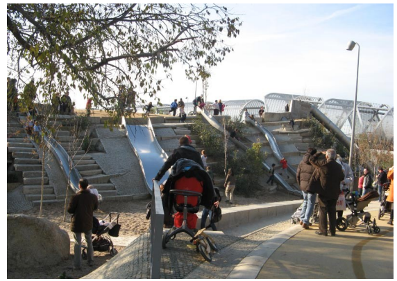
Would OSHA approve of these toboggan slides?