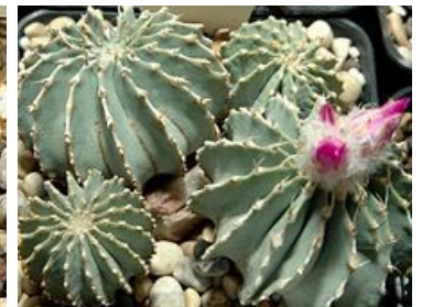
Geohintonia Mexicana http://en.wikipedia.org/wiki/Geohintonia