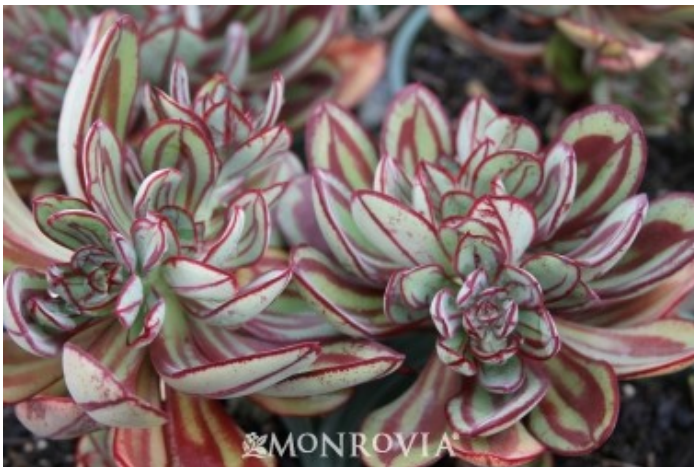
Echeveria nodulosa Painted Echeveria http://www.monrovia.com