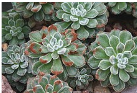
Echeveria setosa Mexican Fire Cracker

All Echeveria content from: http://en.wikipedia.org/wiki/Echeveria