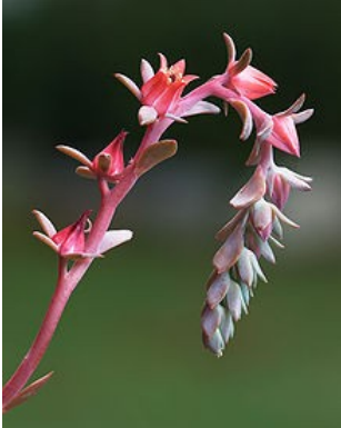
Flowers of Echeveria 'Blue Curl'

Echeveria is a large genus of succulents in the Crasulaceae family, native from Mexico to northwestern South America. The genus is named after the 18th century Mexican botanical artist Atanasio Echeverría y Godoy. Many of the species produce numerous offsets, and are commonly known as 'Hen and chicks', which can also refer to other genera such as Sempervivum that are significantly different from Echeveria .