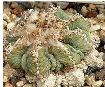
Aztekium ritteri http://en.wikipedia.org/wiki/Aztekium_ritteri

http://en.wikipedia.org/wiki/Turbinicarpus