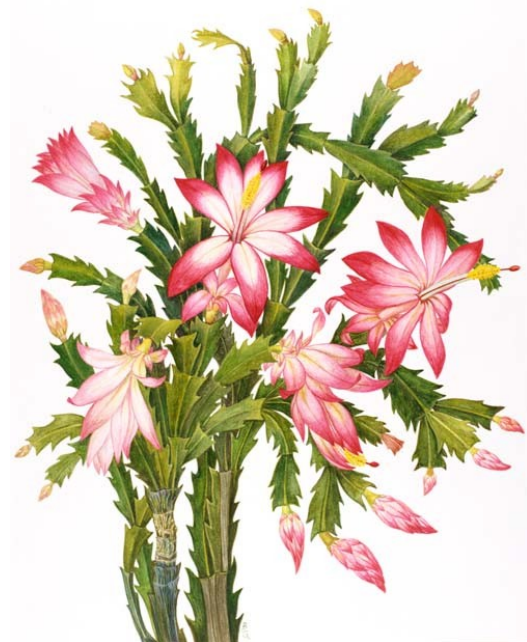
Schlumbergera x buckleyi 'Olivia'