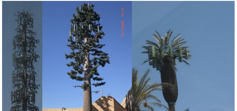
California Cell Phone Towers