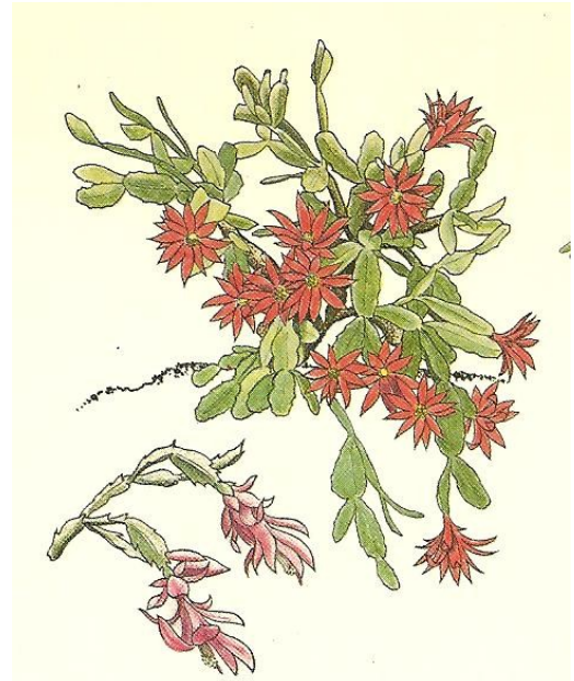
Zygocactus truncatus and Schlumbergera gaertneri

The unusual stems and timely blossoms of these commonly grown house plants are both delightful and fascinating. Christmas cactus is an old favorite. It has striking, bright green arched branches made up of flat, scalloped 1 1/2 inch long joints. The branches droop, especially when in bloom. It's multi-trumpeted, 3-inch long, rosy red flowers, plus other colors, appear at Christmas time.