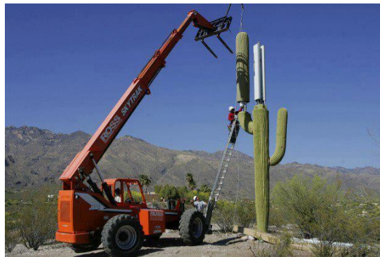
Arizona Cell Phone Towers!

Boy, do I have a bad case of athlete's foot fungus. That red, inflamed toe HURTS! Any homeopathic remedies for treatment out there?