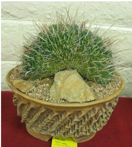
Open - Cactus Stenocactus crispatus crest Gary Duke