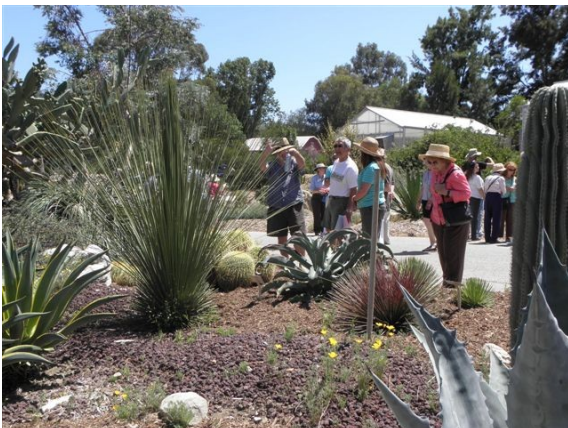
Enjoying the Cactus Garden after the meeting.