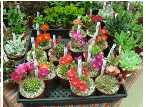
Jim Hann's sale table with blooming Lobivia species cactus