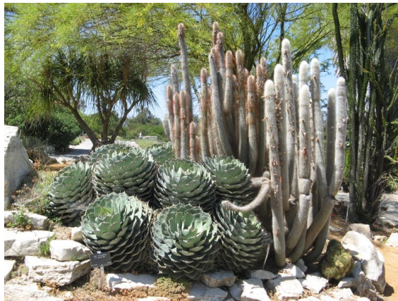
Agave potatorum "verschaffeltii" and Cephalocereus senilis - Old Man Cactus