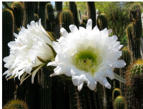
Trichocereus spachianus (Echinopsis spachiana), 'Golden Torch' Argentina, Bolivia taken on our Garden Tour, July 10