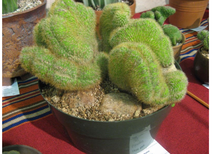
Novice - Cactus Echinopsis crest Jade Neely