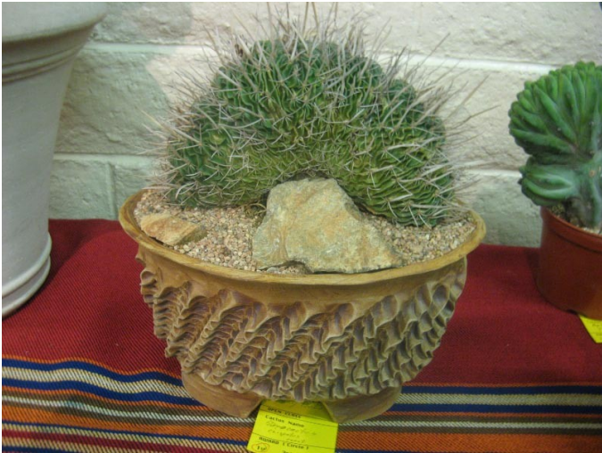
Open - Cactus Stenocactus crispatus cresti Gary Duke