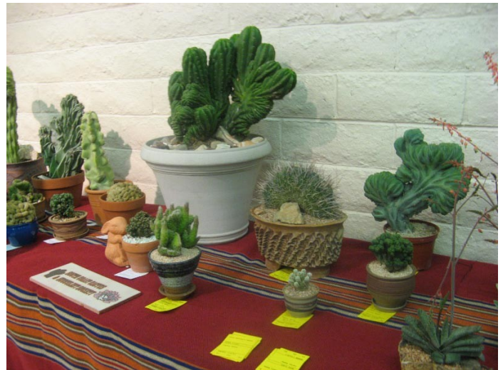
March Mini-Show Crests and Montrose Cactus