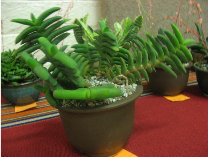
Open - Succulent Gasteria rawlinsonii Laurel Woodley