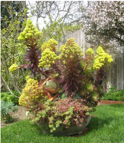
Blooming Aeonium in Melinda Hines' Garden

Do you have a photo of one of your fantastic succulents, cactus or of your garden that you would like to share in the Prickly News. If so send it to Melinda at mel.mindy@verizon.net