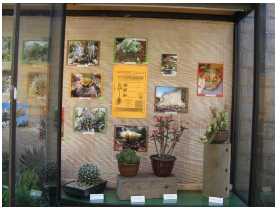
Show Display Window - Plants supplied by Jim Gardner