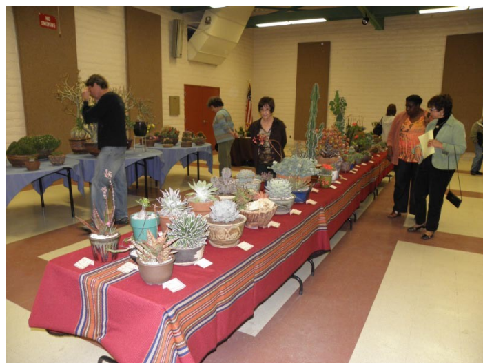
South Cactus & Succulent Society Member's Show Table