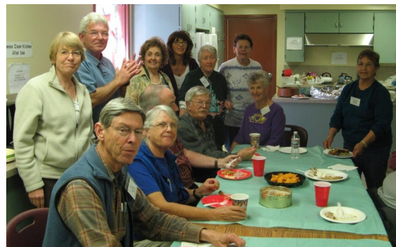
Eating the Leftovers for Sunday Lunch - 2011