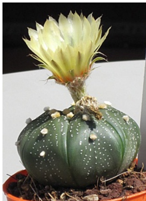
Astrophytum asterias with flower

The generic name is derived from the Greek words (astron), meaning "star," and (phyton), meaning "plant."