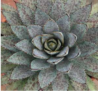
Agave mangave 'bloodspot' San Marcos Growers