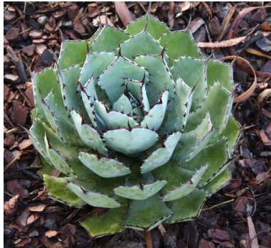
Agave potatorum 'Kichiokan' Wikipedia