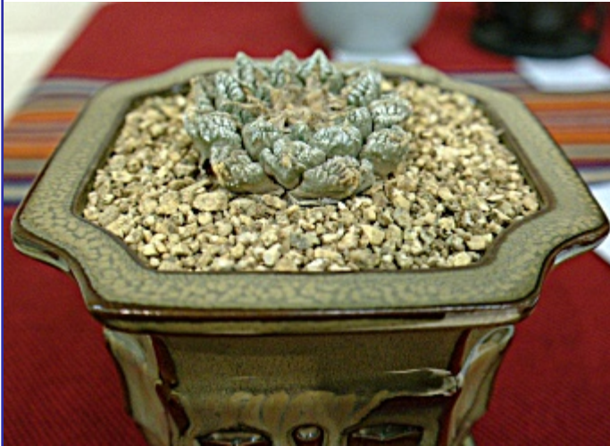
Jim Wood - Ariocarpus fissuratus