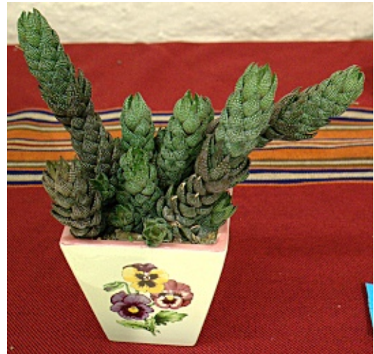
PhyllisDeCrescenzo - Haworthia coarctata