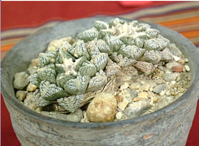
Jade Neely - Ariocarpus fissuratus