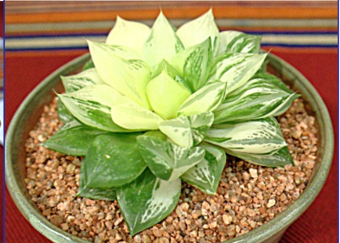
Sally Fasteau - Haworthia cymbiformis variegata