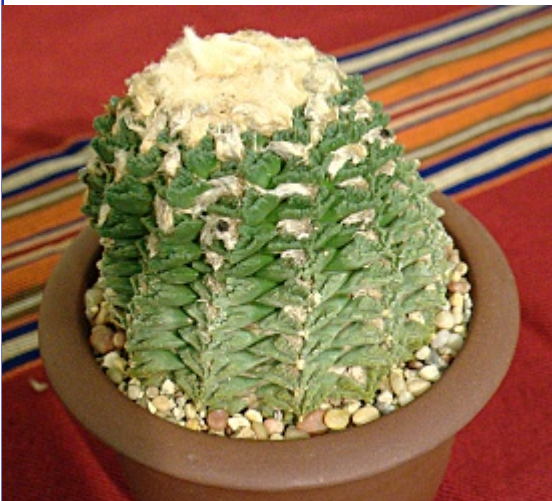
Gary Duke - Ariocarpus fissuratus