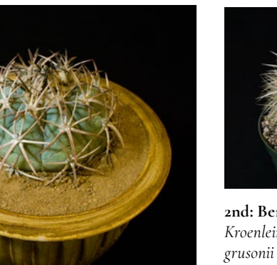
1st: Terri Straub Echinocactus horizonthalonius