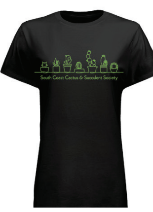
WOMEN'S: SM, MED, LG