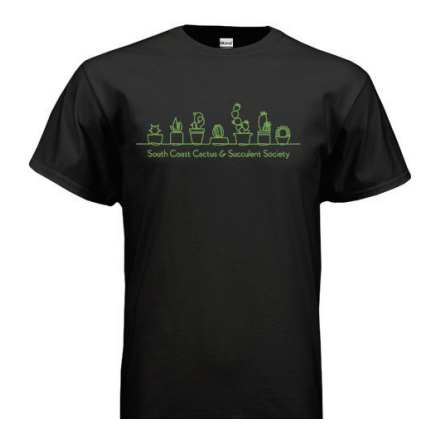
MEN'S: MED, LG, XL