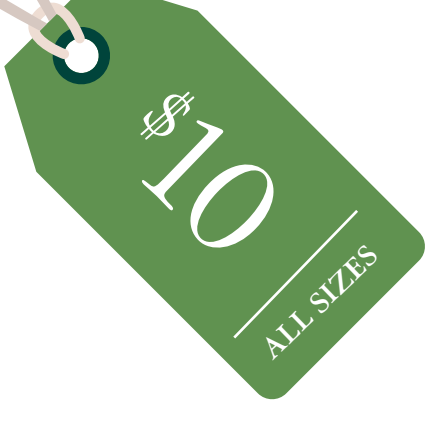
For sale at the next SCCSS meeting