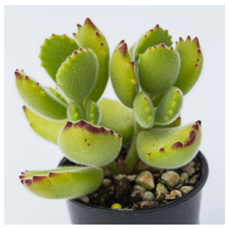
Cotyledon tomentosa Ladismithiensis

The species in the genus Cotyledon range from South Africa to Arabia. Many of the species that used to be included have