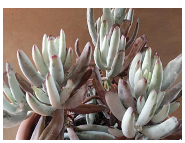
Cotyledon 'White sprite'

Most Cotyledon are easily grown from cuttings.