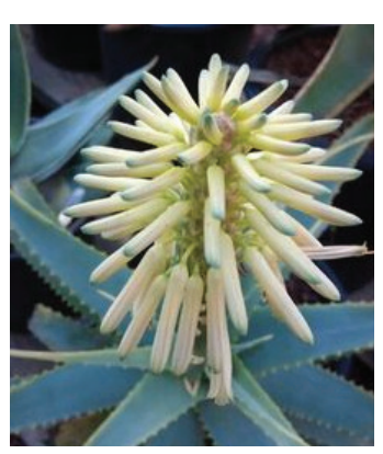
Aloe "YellowTorch in Bloom"