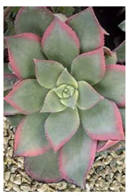
Aeonium haworthii f. variegata