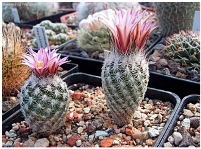
Gymnocactus subterraneus var. zaragosae