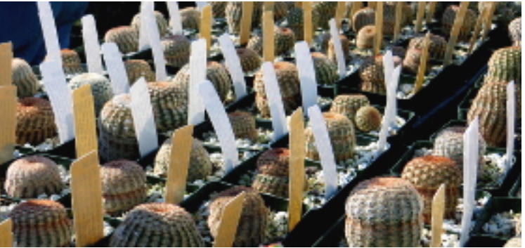
Get ready to make your selection at the April Show & Sale April 11 - 12, 9:00 am - 4:00 pm

Good growing everyone. Dale La Forest, President.