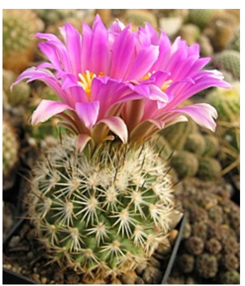
Gymnocactus beguinii v senilis