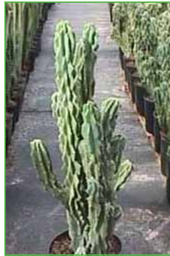
Cereus Peruvianus Monstrose