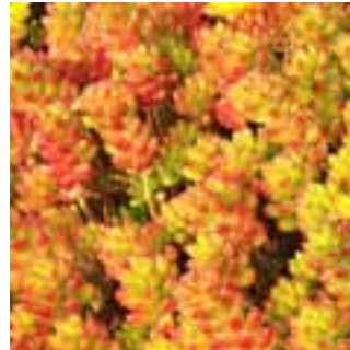
Pork n Beans Sedum (Sedum rubrotinctum)