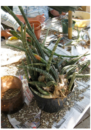
Sansevieria fischeri ready to be re-potted