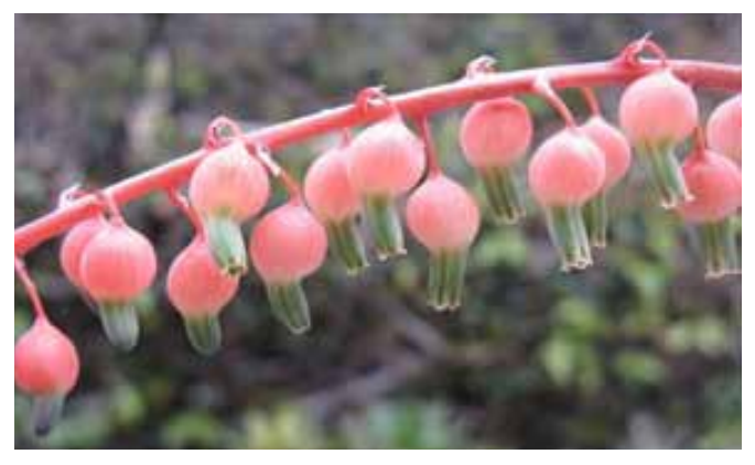
Gasteria baylissii flowers