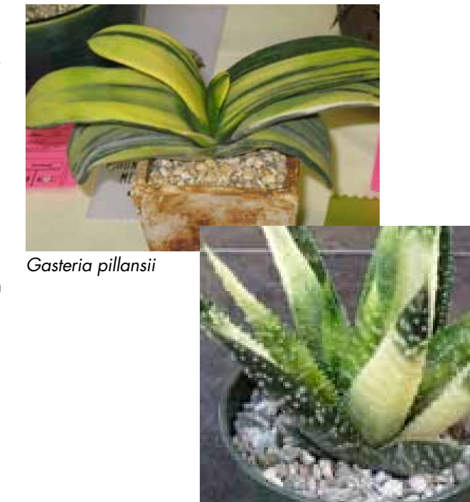
Gasteria 'Ghost of Carlsbad'