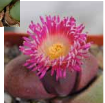
pleiosipilos nelii 'royal flush'

Mesembs are the most fascinating of the plant groups with their enormous range of weird and wonderful forms and adaptations that facilitate survival in unique and hostile environments (mostly South African). Recent research indicates they are probably the most rapidly evolving group of plants in the world. The mesembryanthema as they are informally known, comprise two of four sub-families, the Mesembryanthemoidea and the Ruschioideae, of the Aizoaceae plant family. It should be no surprise that the Aizoaceae belong to the most fascination of the many plant orders - the Caryophyllales.