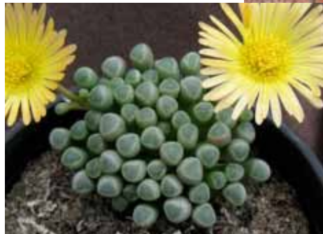
fenestraria rhopalophylla 'baby toes'