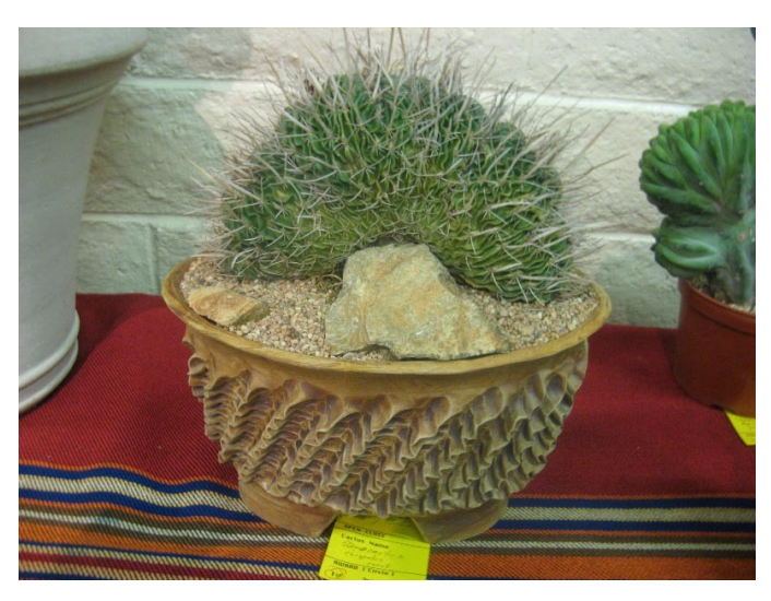
Open - Cactus Stenocactus crispatus cresti Gary Duke