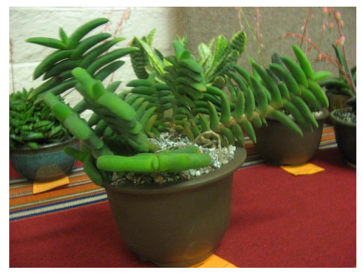
Open - Succulent Gasteria rawlinsonii Laurel Woodley