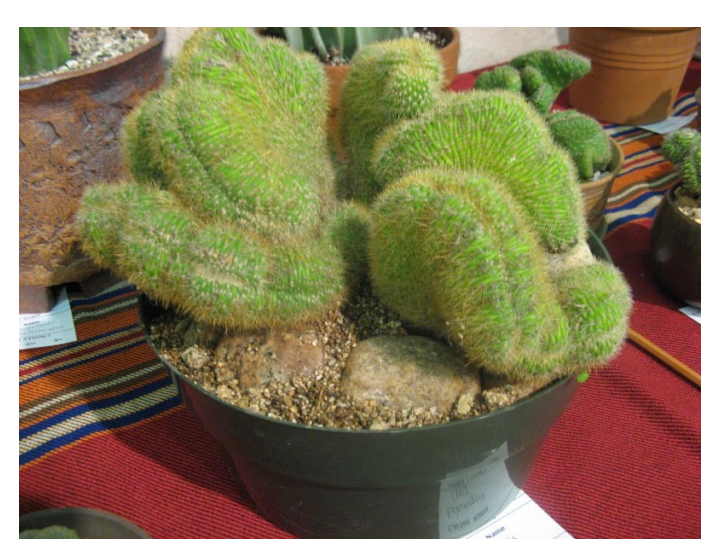
Novice - Cactus Echinopsis crest Jade Neely