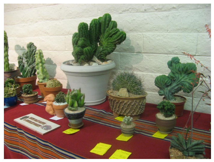
March Mini-Show Crests and Montrose Cactus