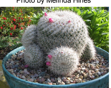
Mammillaria geminispina