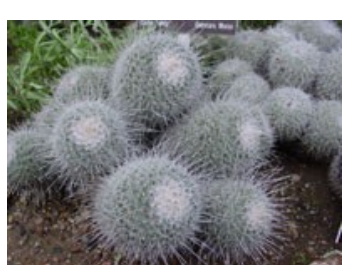
Mammillaria Parkinsonii Boyce Thompson Arboretum, Superior, AZ