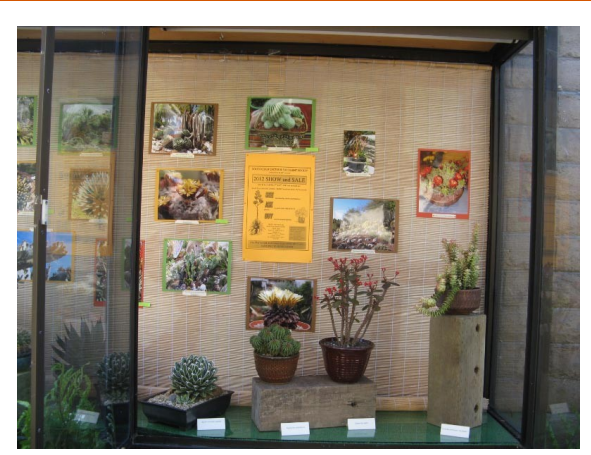
Show Display Window - Plants supplied by Jim Gardner