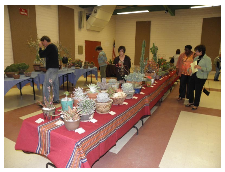
South Cactus & Succulent Society Member's Show Table