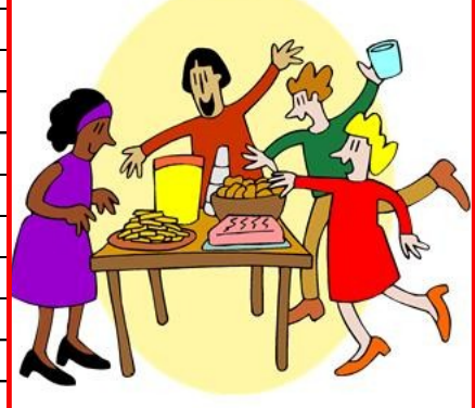
Remember to bring your food for the Potluck! Salad, Side Dish or Dessert