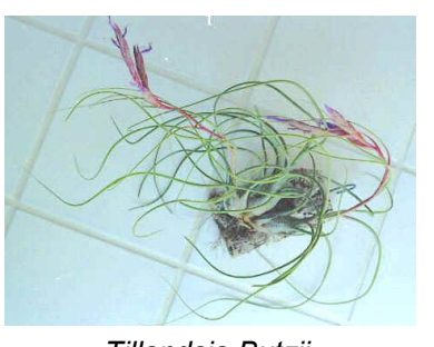
Tillandsia Butzii