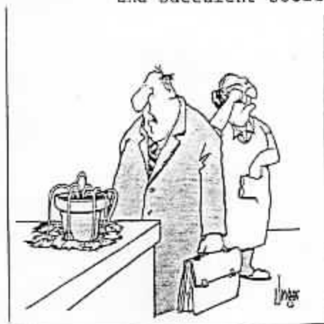
"What song did you sing?"

ANY CHG. IN TYPE OF SUCCULENT YOU LIKE BEST? _____