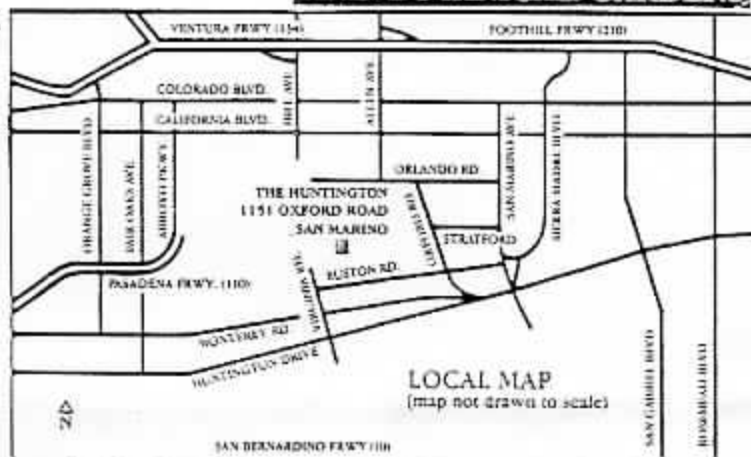
LOCAL MAP (map not drawn to scale)